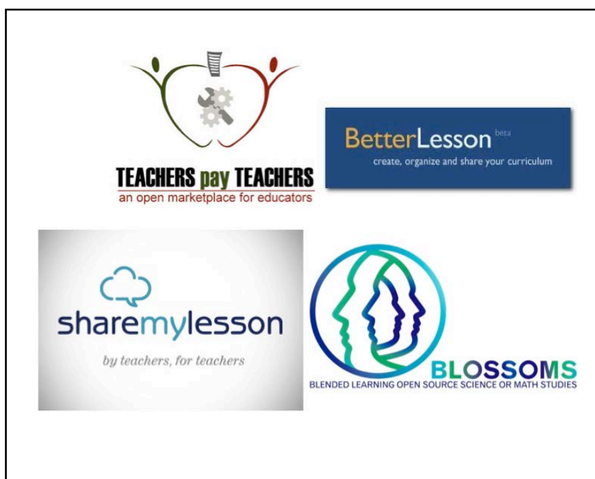
Figure 3. Logos of some of the popular lesson sharing services.