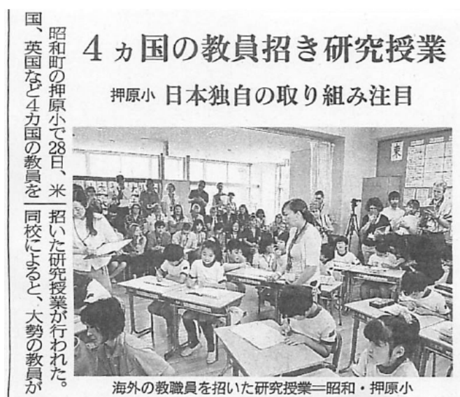
Figure 4. An example of a lesson study class in primary school.