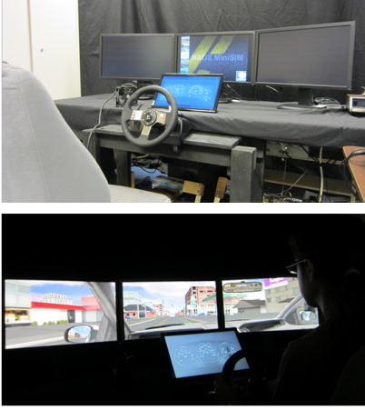
Fig. 3. Driving simulator at UMTRI where experiments were conducted