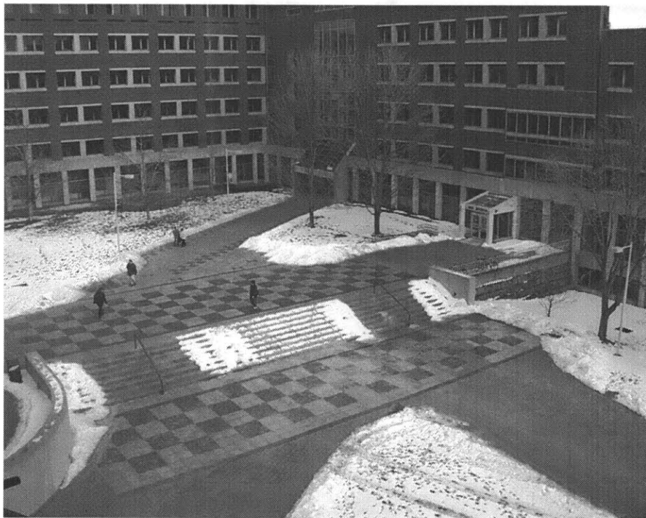
Figure 5-1: The “field” in this implementation of Hear&There . Because of technical limitations on the GPS, we limited this project to the Media Lab courtyard.