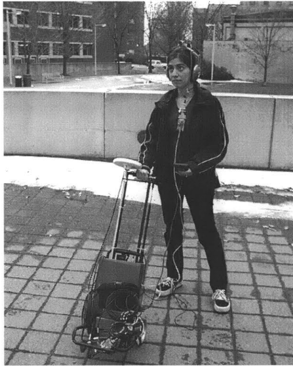
Figure 5-3: The hardware for Hear&There used in the field. The highly accurate GPS receiver is rather large, so we have attached it to a luggage cart.