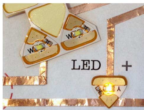
Figure 1. Illuminated LED circuit sticker

We designed the experience to feel just like crafting with traditional stickers, except with the additional functionality of light, sensing and programmability. In doing so, our goal is to create an “on ramp” to new electronics concepts like inputs and outputs or series and parallel circuits through familiar materials and interactions. Following the constructionist tradition, our kit aims to be tangible and open-ended so that children will be motivated to learn these new concepts in order to create more complex and personally meaningful craft projects [1].