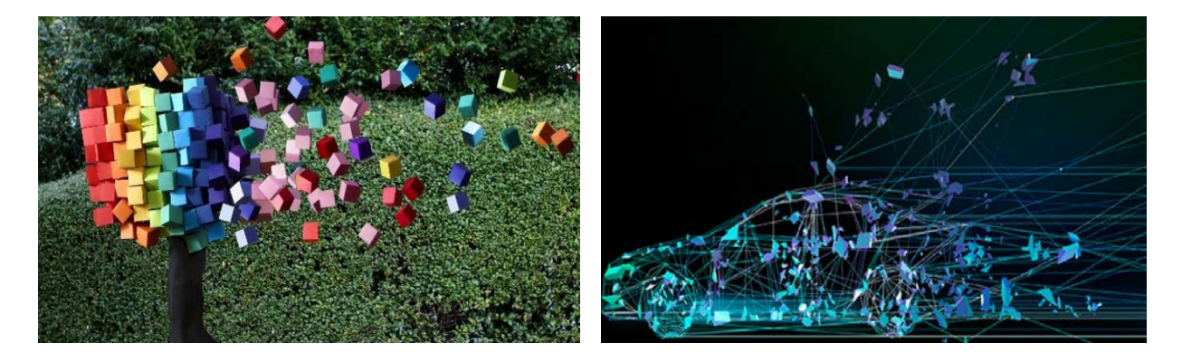
Who will build these blocks? The new lego business of security: confluence of telco, mobile apps, data, analytics, AI, IoT, blockchain, edge services and individual identity - functions converging from system of ecosystems<sup>37</sup>

Concurrent execution, co-location and semantic interoperability between standards and/or platforms are key elements of this vision if we wish to transform the suggestions to implementations. But, who will build these blocks? Part of the answer may germinate the next massive business opportunity if distributed security can be modularized to the lowest common denominator. To demolish the barrier to entry, a "pay-a-penny-per-use" service (SECaas) may enable any individual to "buy" security using a mobile app from a business solutions virtual store in a manner similar to buying a lock and a key from a convenience store to secure the suitcase or luggage before handing it over to the airline when flying out.