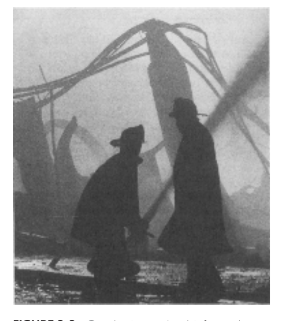
FIGURE 3-3 The Occupational Safety and Health Administration's (OSHA's) positive impact on general industry health and safety in the United States unfortunately does not extend to municipal workers, such as firefighters.

of its procedures, from the development of standards through their implementation and enforcement, OSHA guarantees employers and employees the right to be fully informed, to participate actively, and to appeal its decisions (although employees are limited somewhat in the latter activity).