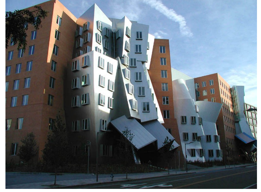
Figure 1. The MIT Stata Center, designed by Frank O. Gehry, completed in 2004 and designed using Dassault Systèmes' CATIA.

videos of the construction site – and voluminous email and document exchange between architects, clients, contractors and other parties (e.g., all the official Requests For Information and corresponding Architect's Supplemental Instructions).