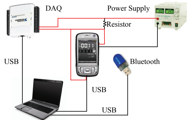
Fig. 1. Profiling environment

Figure 1 shows the profiling environment. The HTC TyTN II phone is connected directly to the power supply to provide constant voltage and reduce complexity of energy measurements. Since this phone, like most modern phones, require communication with the battery in order to operate, we have reused some of the electronic components from the battery pack and wired them directly to the power supply.