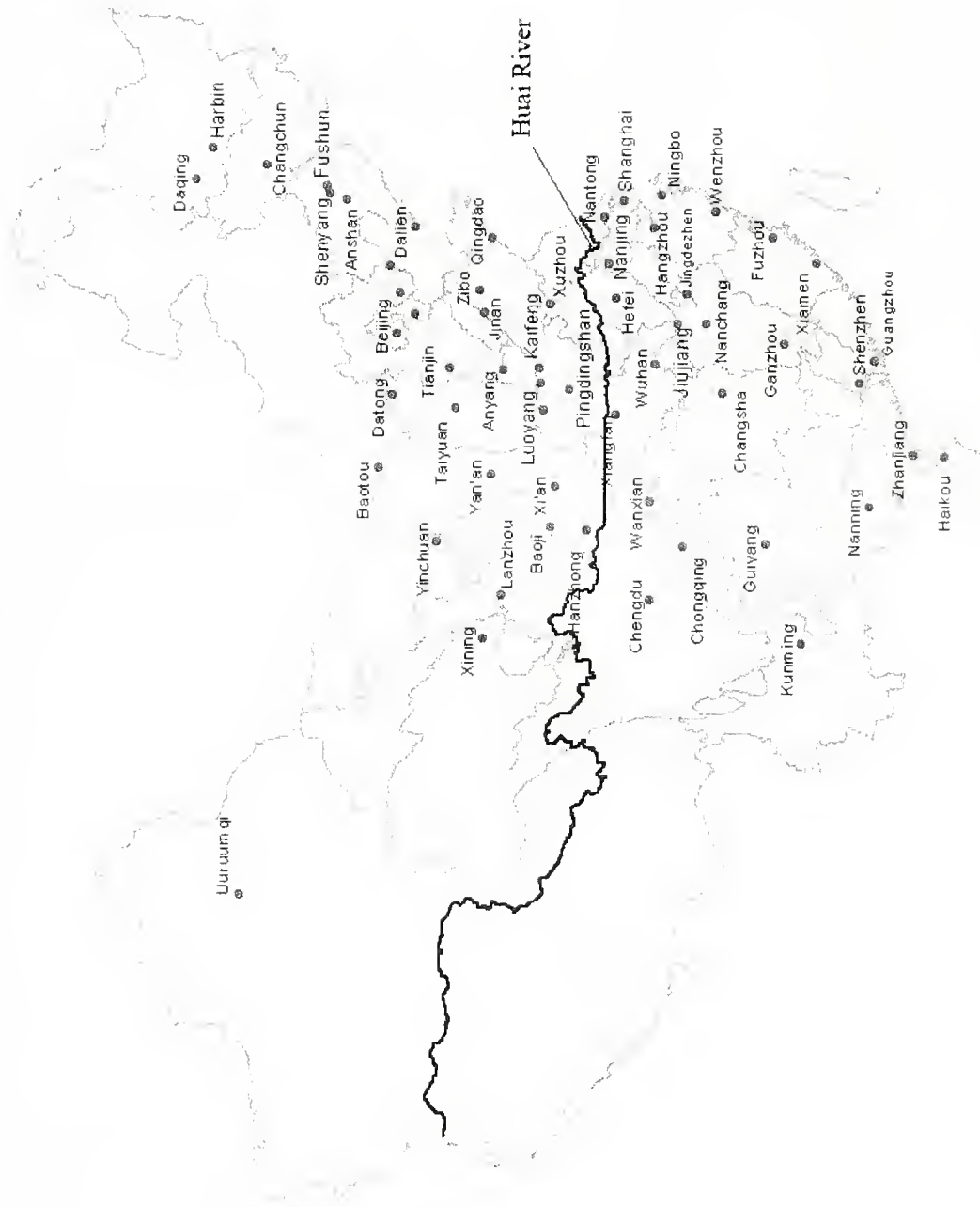
Figure 1: North and South China Denoted by Huai River/Qinling Mountains 0^{\circ} Celsius Line