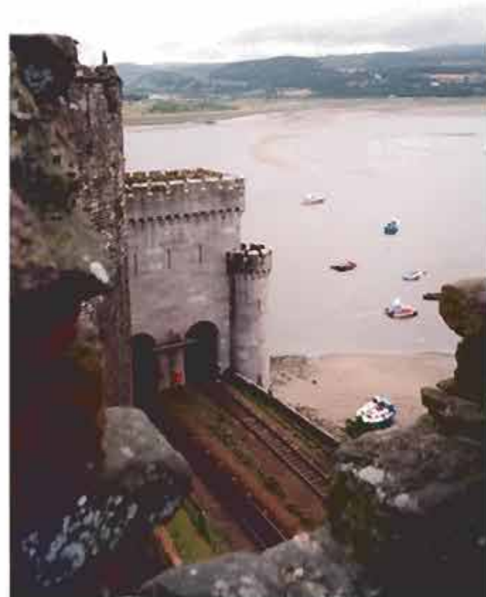
Stephenson RR Bridge, Conwy, Wales