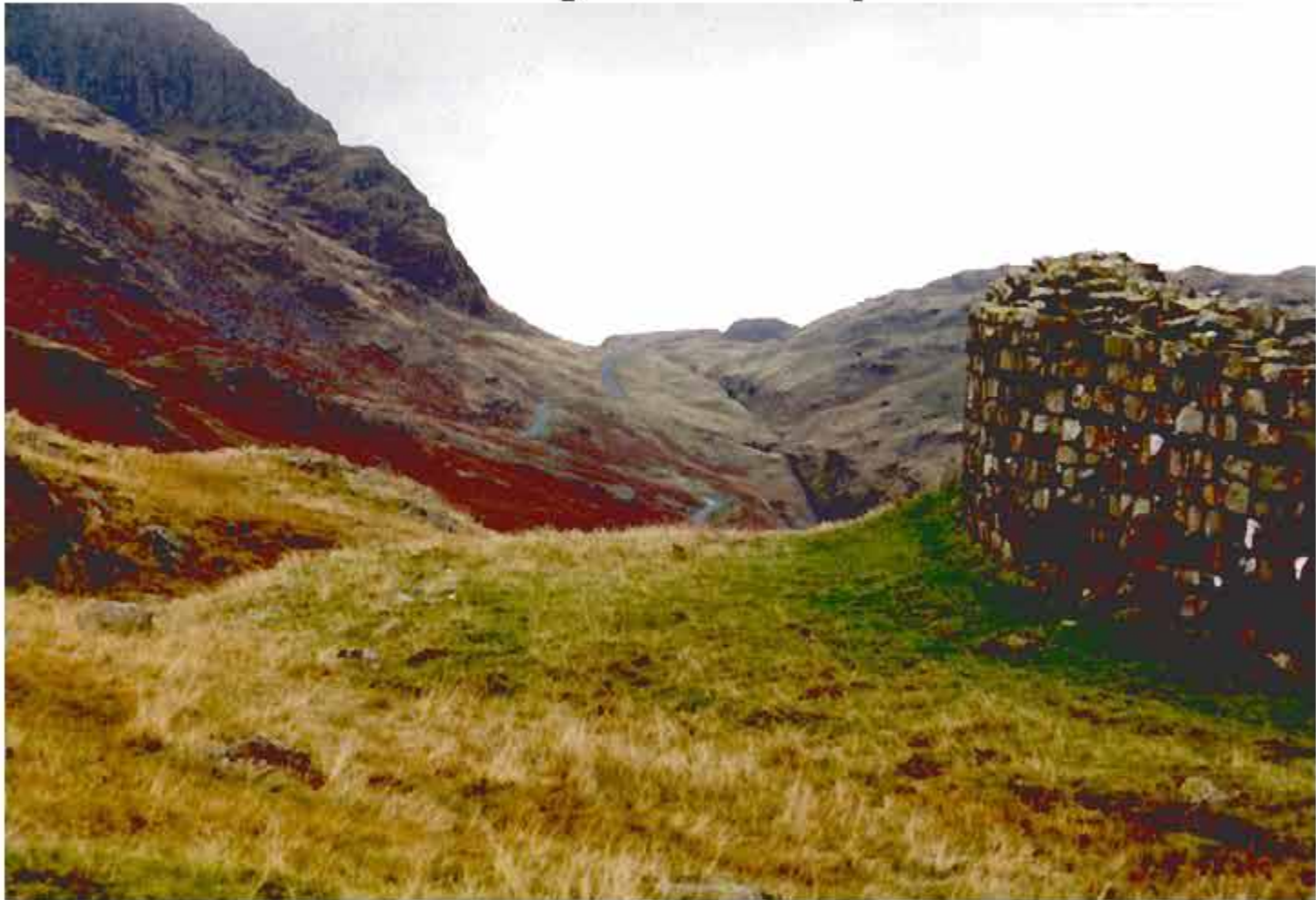
Roman Road & Fort, Hardknott Pass, Lake District, England