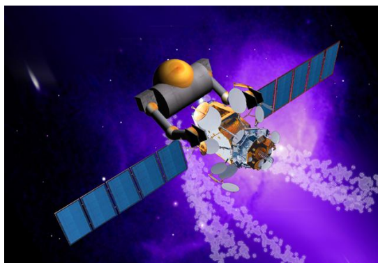
Figure 1 - Artistic representation of a space tug

The first section of this paper will consult the new U.S. Space Transportation Policy, which endorses research and development activities in the area of on-orbit servicing. Next, the legal constraints imposed by customary international law and national law are discussed. Then, a concept of operations in geosynchronous Earth orbit is presented as a framework for the identification of areas where further technical development is needed. Finally, financing and insurance for a space tug is explored. This paper will not argue the business case for a space tug as business analyses exist in the literature. 2,3,4 Instead, it will survey the various finance models that might apply to a space tug system and will discuss the issue of insuring space tug operations. Despite the focus of the space tug system in the geosynchronous belt, much of the discussion in this paper is relevant to on-orbit servicing scenarios in any Earth orbit.