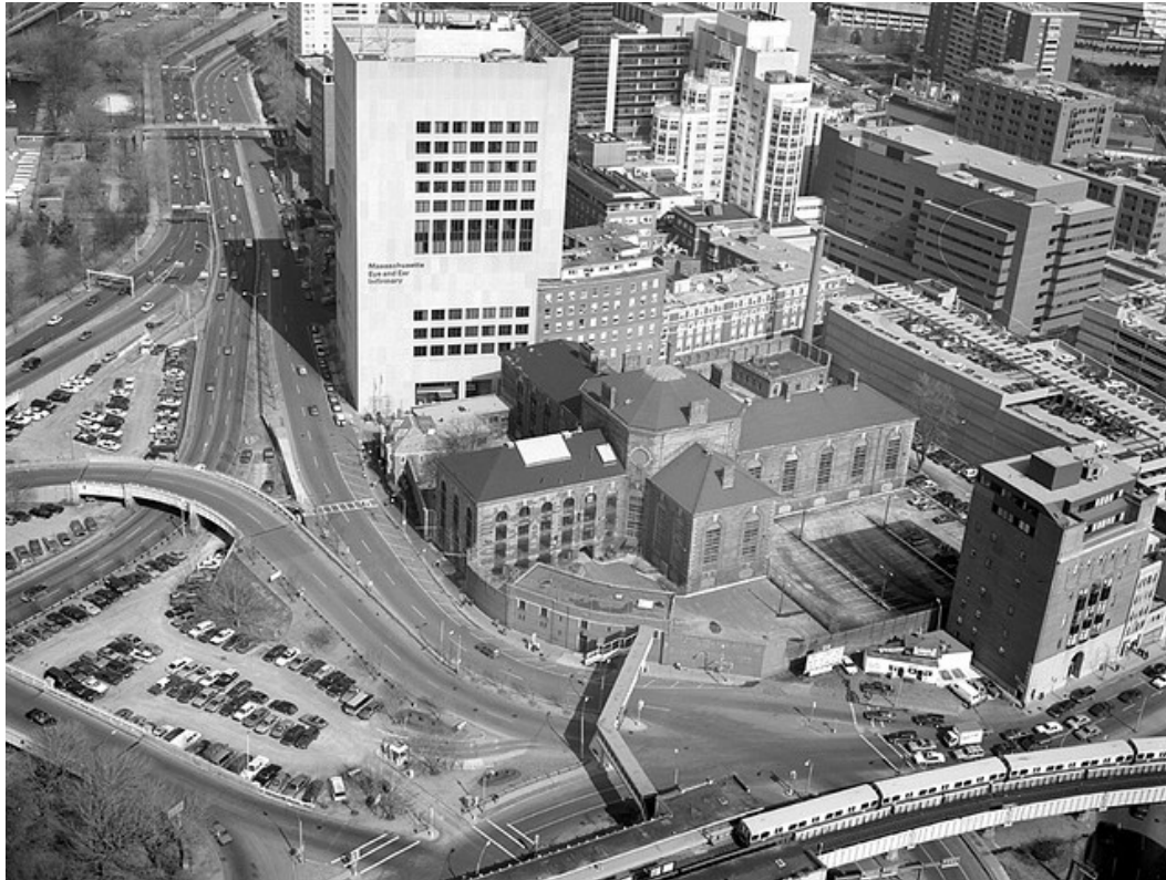
The Charles Street Jail, 1980's 20 .

to sell the property in 1991. Due to its history, and highly visible location, the original jail was listed on both the State and National Registries of Historic Places 19 .