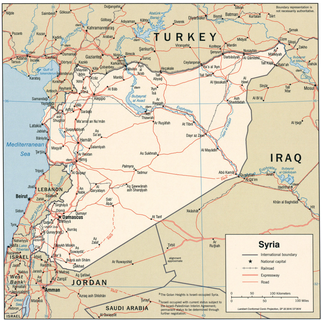
Figure 1: Political Map of Syria