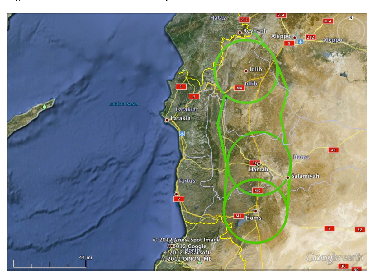
Figure 3: Safe Havens in Northwest Syria

Note : This map is notional. It is only intended as an illustration for the purposes of this analysis.