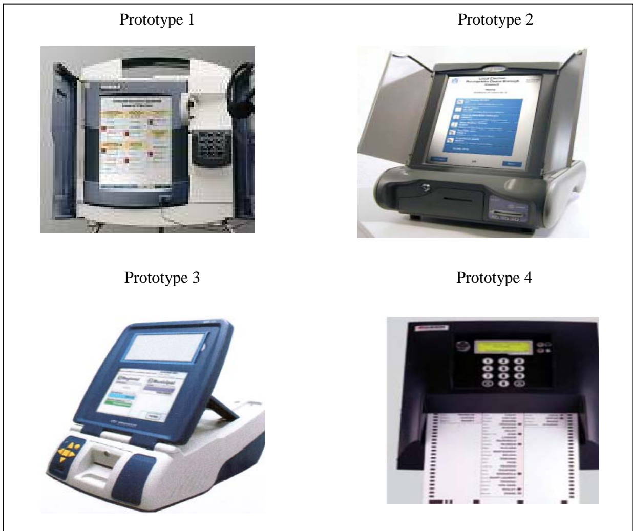
Figure 2 plots the four voting prototypes tested in Colombia's 2007 e-voting pilot.

The last prototype, Prototype 4 , was an optical scan (OS) device not equipped with a smart card reader. The staff supervising the test provided each participant with a paper ballot including all the relevant information (party name, logo, number, and the complete list of candidates for each race). Voters marked their preferences for the presidential and senate race with a special pencil on the paper ballot and introduced it into the scanner. The only possibility of changing the vote once the ballot was introduced into the scanner was if the voter had cast an invalid vote or left the ballot blank. In both cases, the voter was notified of the potential mistake, and had the option of correcting it or casting the vote