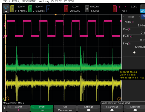
Figure 2. Comparison of noise spikes seen at the output of the unlocked science chain readout (green and yellow) with the square wave passing between the digital sine generator board and the germanium thermometer readout board in the ADR controller stack (pink). That these signals are correlated shows that the sine wave was ultimately responsible for the noise on the SQUIDs.

Following detector optimization, the remaining subsystems will be integrated into the system. The radioactive source for in-flight calibration and the optical blocking filters will be added to the inside of the cryostat. The X-ray mirror, which has already been calibrated, will be aligned with the detectors. Finally, full integration and testing at the Wallops Flight Facility will follow.