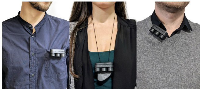
Fig. 1. BioEssence is a wearable olfactory display that can be worn as a clip or as a necklace. The device can easily be attached to pockets, shirt necklines, jewelry threads, and cords.

While there is a growing interest in the study of scents, most of the olfactory displays used in clinical laboratory