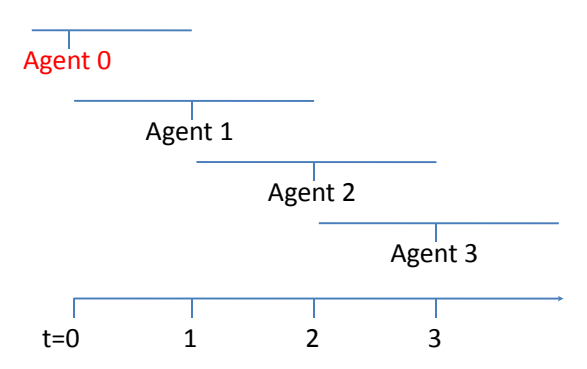
Figure 1: Demographics

Consider an overlapping-generations model where agents live for two periods. We suppose for simplicity that there is a single agent born in each period (generation), and each agent's payoffs are determined by her interaction with agents from the two neighboring generations (older and younger agents). Figure 1 shows the structure of interaction between agents of different generations.