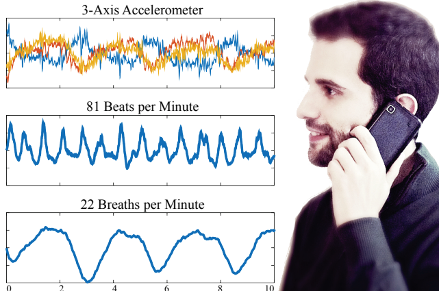
Figure 1. Motion sensors of a smartphones can be used to recover heart and breathing rates of the users during stationary positions and activities such as listening on the phone.

In recent work [7][8], we have demonstrated that motion sensors embedded in head-mounted and wrist-worn wearable devices such as Google Glass and Galaxy Gear can capture heart and breathing rates accurately. While the results were very promising, not everybody uses these types of wearable devices as they may be cumbersome and stigmatizing. Motivated by these challenges, this work explores the possibility of using motion sensors of currently available smartphones while being carried in different locations on the body (e.g., trouser pocket, shoulder bag) and when used during regular phone activities (e.g., watching a video, listening to a conversation), as depicted on Fig. 1. In the following, we review relevant research in physiological measurement with smartphones. Then, we describe methods to capture heart rate (HR) and breathing rate (BR) from motion data as well as the experimental design to validate them. Finally, we provide a quantitative comparison of our methods with FDA-cleared sensors and concluding remarks.