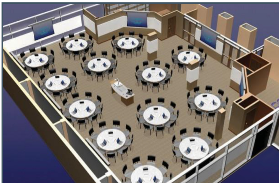
Figure 3: Technology Enhanced Active Learning classroom at MIT

A third topic is the architecture and design of learning spaces. The MIT Institute-Wide Task Force on the Future of Education at MIT recommended a rethinking of spaces at MIT to better support blended learning. Figure 3 shows the TEAL classroom at MIT; many universities are adopting