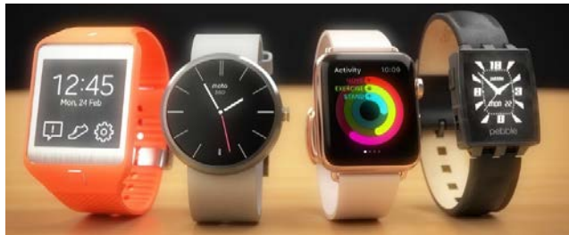
Figure 1. FROM LEFT TO RIGHT ARE SAMSUNG GEAR, MOTOROLA MOTO 360, APPLE WATCH, AND PEBBLE STEEL.

53 updates to and received 15,629 comments from their supporters and kept them updated. Through these highly engaged interactions on Kickstarter, Pebble was able to quickly improve product design concepts and the design process, and promptly respond to supporters' needs and expectations. With the funding raised for product development and manufacturing, Pebble significantly improved its watch hardware, software and service design, and successfully delivered the rewards, i.e. the pre-ordered watches, to the many supporters. Pebble's success also validated market demands for smart watches in general, which attracted many established companies to follow with similar products (see Fig. 1), including Samsung, Motorola, Apple, Sony, and others.