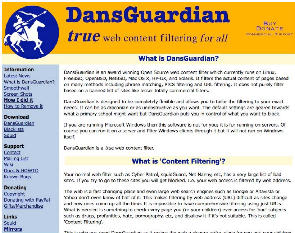
Figure 9. An explanation of DansGuardian, written by Dan.

While Dan locates filtering agency "in" his code, other providers distribute it across a network of actors. In a corporate blog post addressing CIPA compliance, a Barracuda employee assures administrators that its "preclassified" blacklist of URLs is "continuously updated by engineers at Barracuda Central and delivered hourly via the Energize Updates subscription service sold with the Barracuda Web Filter," which can then be manipulated further by local technicians (Barry, 2015, p. 5). Indeed, the marketing materials of filtering companies at once presume and reflect the complexity of filtering systems, prescribing local administrators toggling categories populated by algorithms, coded by engineers, to meet a market opportunity induced by federal legislation, impelled by moral panics, implemented by understaffed institutions, to serve fickle patrons.