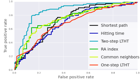
Figure 3: The two-step LTHT (defined above Theorem 4.8) outperforms others at word similarity estimation including the basic log-LTHT.

Theorem 4.9. If q_i = q = o(g_n^{d/2}) for all i , for any \delta > 0 there are c_1, c_2 and h_n so that for any i, j , with probability at least 1 - \delta we have