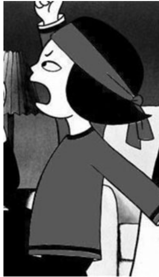
FIGURE 2. “Where Is My Vote?” by or in the style of Marjane Satrapi.