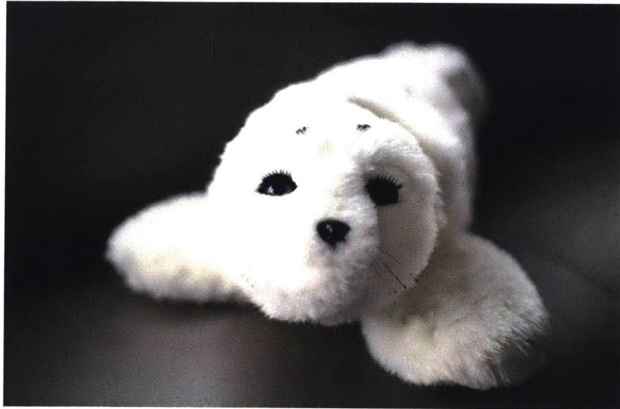
Figure 1: The therapeutic robot seal – PARO

Built to accompany an elder in ways similar to a living pet, the robot seal has a furry cover like a cute puppy. This seal invites cuddling. PARO holds the Guinness Book of World Record's certificate for the world's most therapeutic robot. PARO has been proven to reduce the stress of both patients and their caregivers 28 . It's main psychological effect is helping people relax. Through its posture sensors, the robot can react accordingly to its interaction with the patient. For example, when a patient pats it on the head, it will blink and shake its head "happily." Furthermore, if PARO does something the patient does not like, and the patient scolds it afterwards, PARO will remember its previous action and try not to repeat that action. Through these interactions, PARO responds as if it is alive. From the reactions of the baby seal we can see the advances in robotics. As robotics continue to improve, and robotic pets become cheaper and more "intelligent", companies can find new business opportunities.