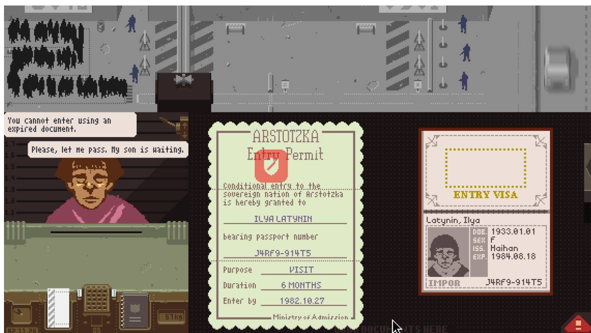
Figure 2. A screenshot from Papers, Please showing the interface as the player decides whether to admit a traveler. The traveler in question previously stated that she was coming to visit her son, who she has not seen in 6 years. Although her entry permit is slightly out-of-date, she is asking for leniency. At this point, the player must decide to either approve or deny her visa.

Of interest to this analysis is the choice shown in Figure 2, and similar choices with higher stakes which come up at several points in the game. In each case, the player must decide whether to take someone at their word that, despite a missing or incorrect document, they still deserve admission. This decision is complicated by the fact that the game also presents situations where applicants attempt to bribe or threaten the player, implying that not all of their claims can be taken at face value. This decision about the fate of an ostensible refugee (or similar person) embodies one of the central themes of the game: how the uncertainty of information from unreliable sources can be pitted against the certain plight of one's family to turn a moral dilemma into a choice with a reluctant "better" option. In the rest of this section, we show the results of each step of a choice poetic analysis (see Section 1) for the choice described in Figure 2.