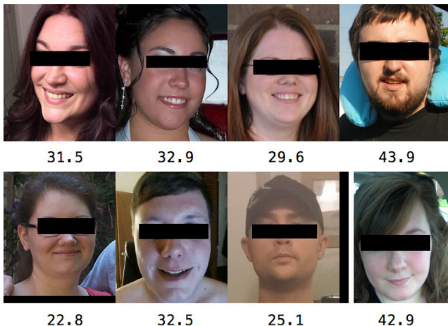
Figure 1: Examples of the cleaned images used for model training. The black bars have been added to respect user privacy, but the model is learned on the original, public images.

This led to a total of 4206 faces with corresponding gender and BMI information. Of these, seven were in the underweight range ( 16 < \text{BMI} \leq 18.5 ), 680 were normal ( 18.5 < \text{BMI} \leq 25 ), 1151 were overweight ( 25 < \text{BMI} \leq 30 ), 941 were moderately obese ( 30 < \text{BMI} \leq 35 ), 681 were severely obese ( 35 < \text{BMI} \leq 40 ) and 746 were very severely obese ( 40 < \text{BMI} ). The dataset contained 2438 males and 1768 females. Figure 1 shows a selection of the faces that were used for training and evaluating our system.