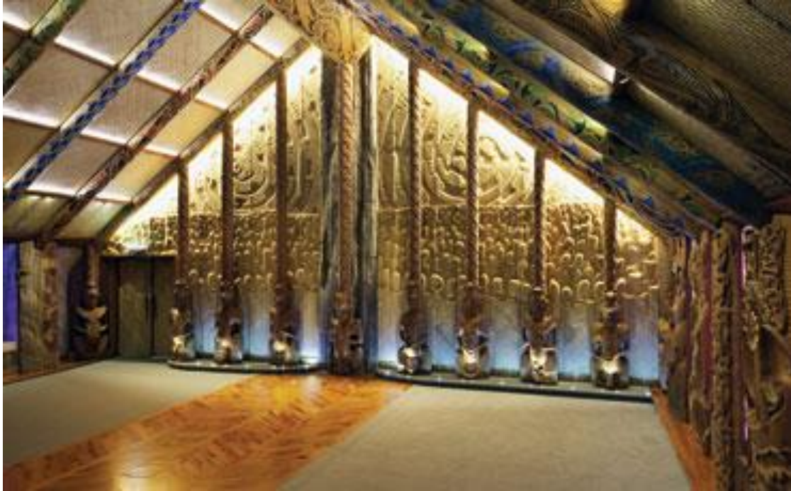
Figure 30. Lyonel Grant, 'Ngākau Māhaki' Te Noho Kotahitanga, 2009, interior view, Unitec Institute of Technology, Auckland, New Zealand

Ka mihi ki a tākuta Lyonel Grant, te ohu raranga me wāna kaitautoko katoa.