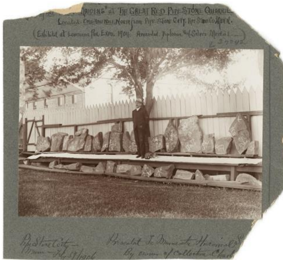
Figure 9. 'Charles H. Bennett removed these rock panels showing pictographs from the Pipestone quarries at the foot of The Three Maidens in the 1880s.'

This episode is emblematic of the looting of our cultural property that took place during white settlement of our land, which has been a major part of the campaign of cultural genocide perpetrated on us. This looting and desecration of sites of cultural and sacred significance to Indigenous peoples continues to be a current major issue across the continent, and was a factor in the recent designation of the Bear's Ears National Monument in Utah. 89