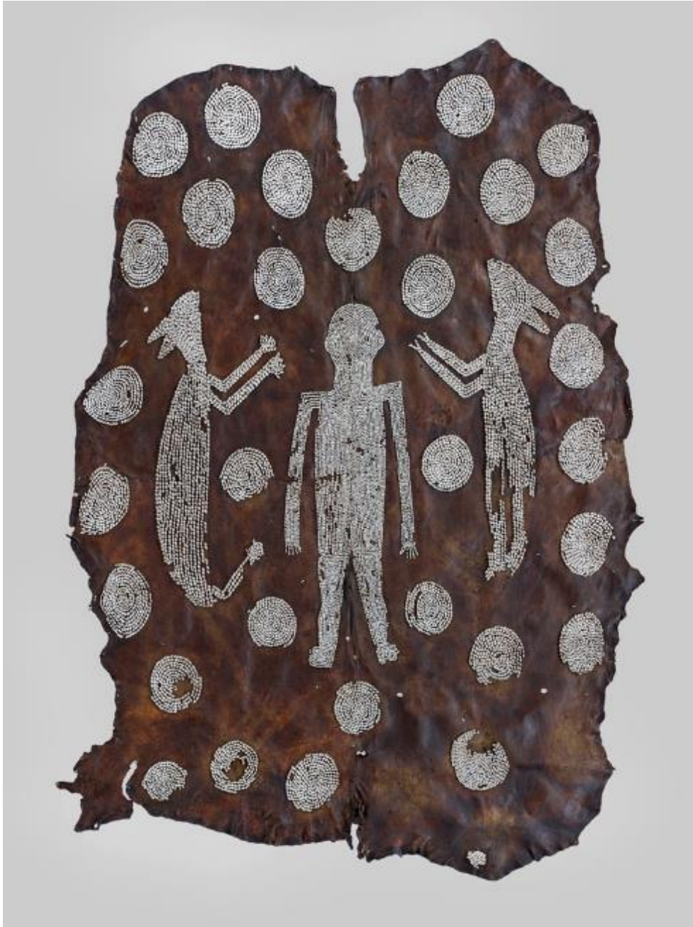
Figure 2. Powhatan's Mantle, 93" x 63", deer hide with shell bead decoration and sinew, 17th century (1601 - 1700), said to have been owned by Wahunsunacock, place of creation: Virginia Colony.

that was thought to be a robe. I have never seen anything quite like it in the museum collection work I have done.