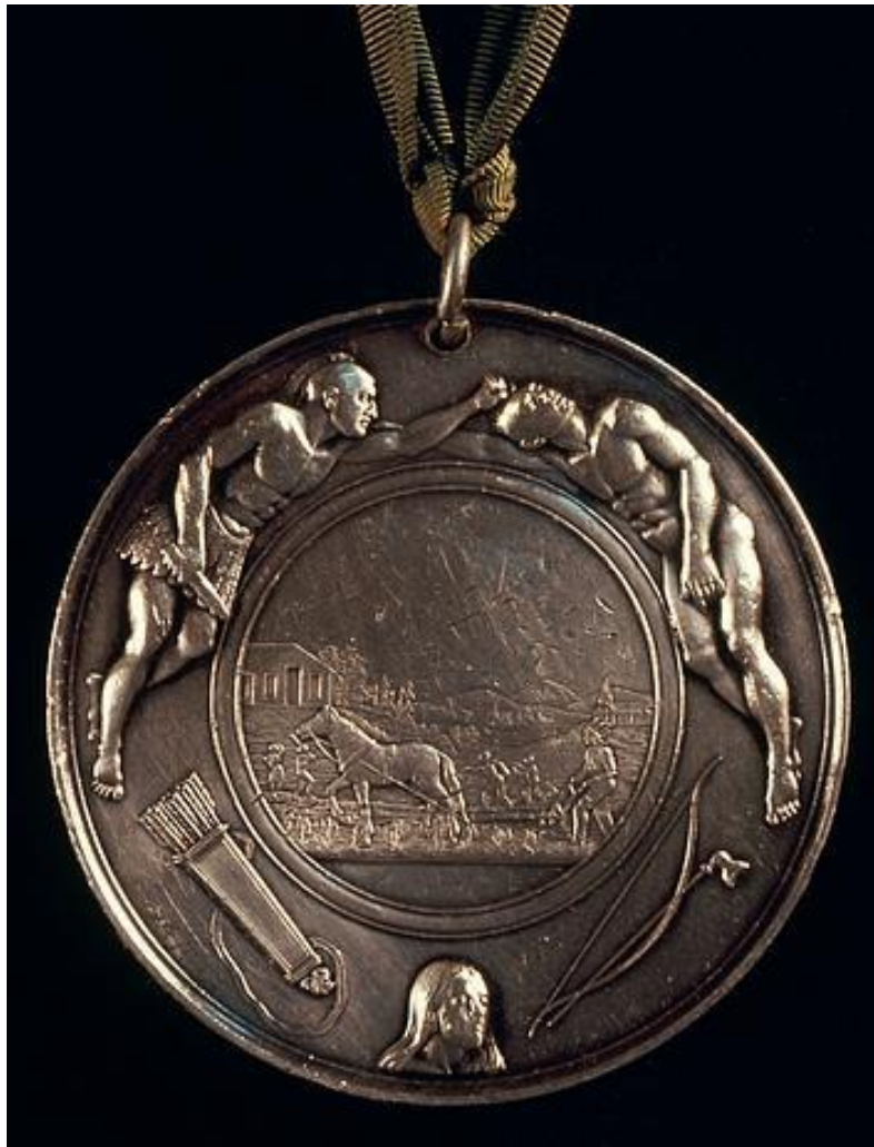
Figure 13. Abraham Lincoln Peace Medal , 1862, National Museum of the American Indian, Smithsonian Institution (24/1213).

The level of hatred towards Native people at the time was great, as American settlers felt they had a divine right to the land, that they were entitled to it because tribal people were savage and primitive, as demonstrated by Manifest Destiny. When Indigenous people resisted, they were brutalized.