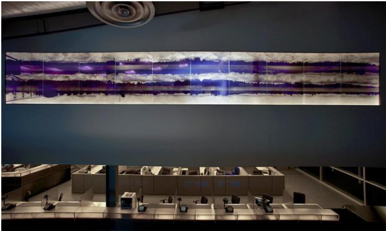
Figure 28. Alan Michelson, Third Bank of the River , 2009, etched glass, Massena, NY

Speaking with Alan Michelson on September 28, 2019, I learned that his works are products of extensive research, and seek to bring Indigenous legacies back into spaces where they have been marginalized. Like Nora's works, they are also closely connected to the land of each site. Third Bank of the River is beautiful piece created in 2009 for the US Port of Entry in Massena, NY, an international border crossing site. He constructed a two-row wampum pattern using photographs of the landscape at the river crossing site of complicated jurisdictions – American, Canadian, and Mohawk. We also discussed Mantle , a 2018 landscape installation located at Capital Square in Richmond Virginia. It is based upon Powhatan's Mantle , and names the local tribes and waterways of the area while offering visitors to the capital campus respite. It is an alternative to the other chauvinistic monuments on the site. Michelson's work is thoughtful, relevant, and aesthetically tied to the visual culture of the Indigenous people from each site.