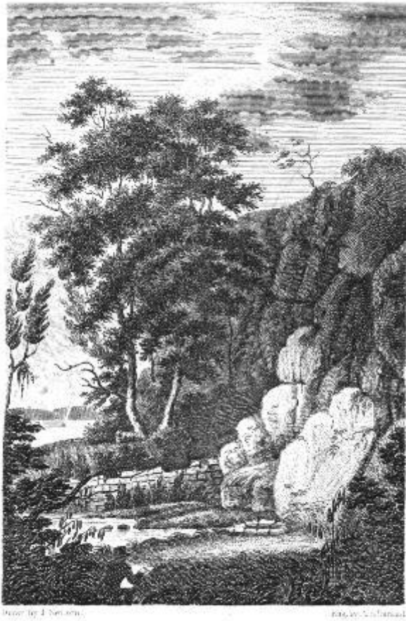
SEAT OF KING PHILIP