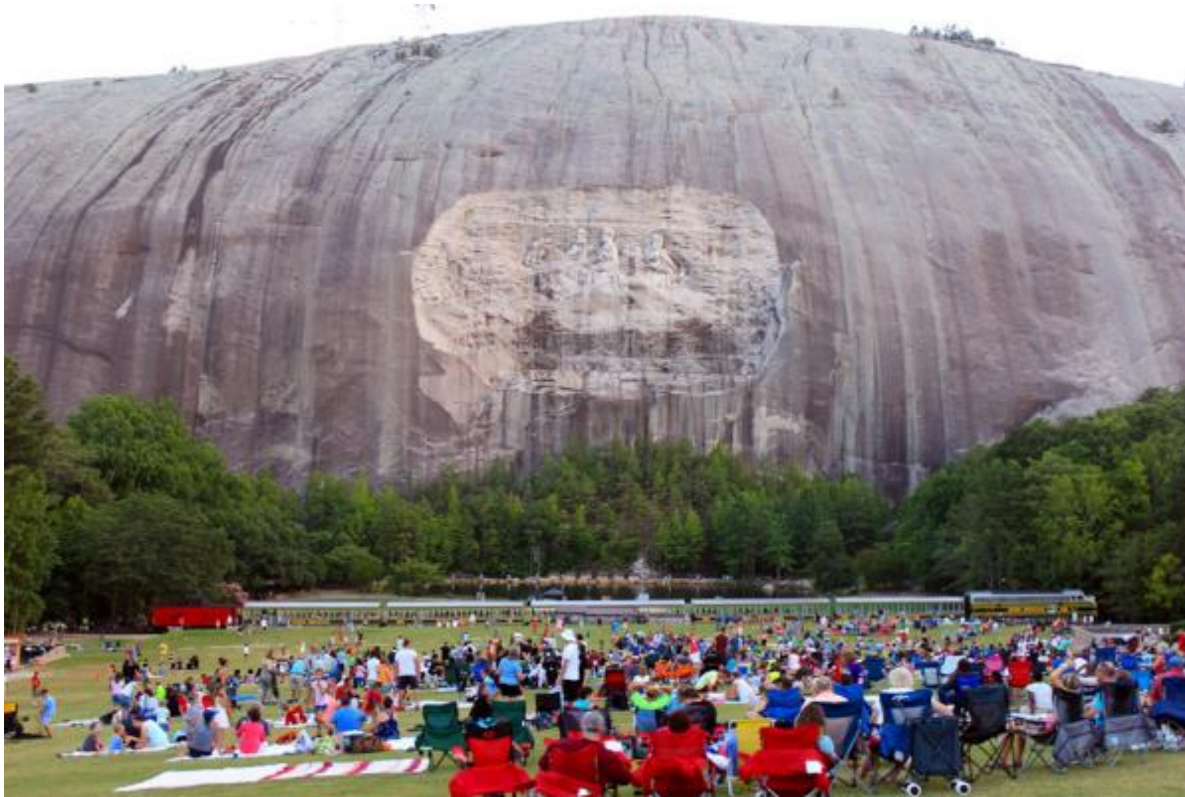
Figure 24. Confederate Memorial Carving, Stone Mountain, Georgia

https://commons.wikimedia.org/wiki/File:Stone_Mountain,_the_carving,_and_the_Train.jpeg