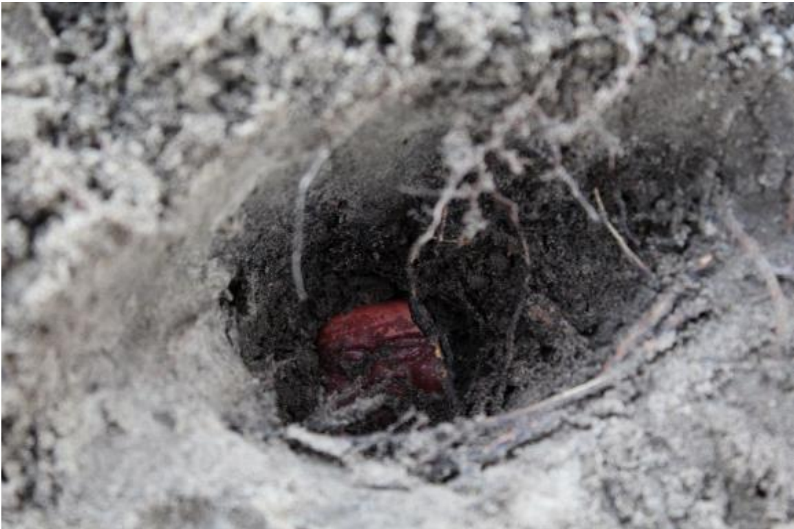
Figure 19. Erin Genia, Placing an offering in the sand at Bdote, Mni Sota , 2017, St. Paul, MN