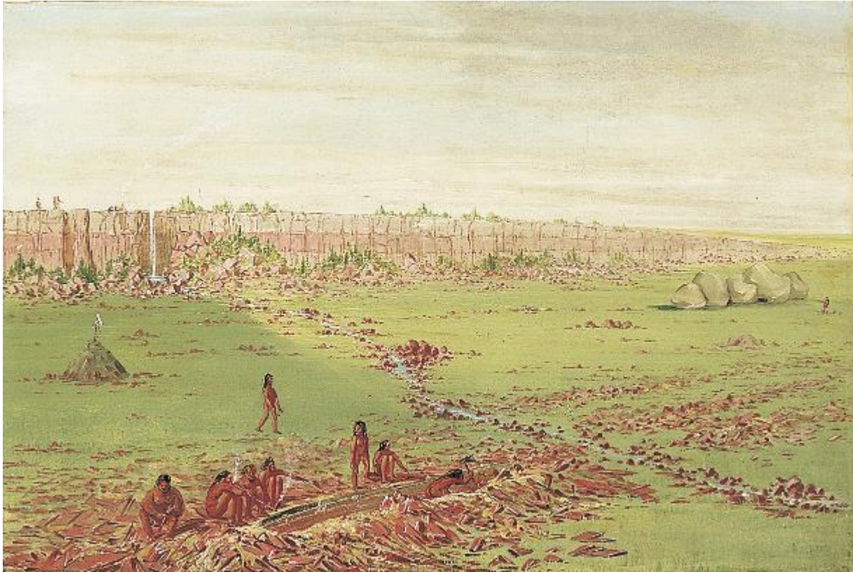
Figure 7. George Catlin, Pipestone Quarry, on the Coteau des Prairies , Smithsonian American Art Museum, 1836-37, Washington DC

re-create certain forms in pipestone or clay and other materials so that I can learn traditional Dakota two- and three-dimensional form. I have received support from tribal arts organizations to conduct this work, including a grant from the Potlatch Fund, and a fellowship from the First Peoples Fund. Although I've been engaged in this work for several years now, I have barely scratched the surface of what needs to be done in the enormous arena.