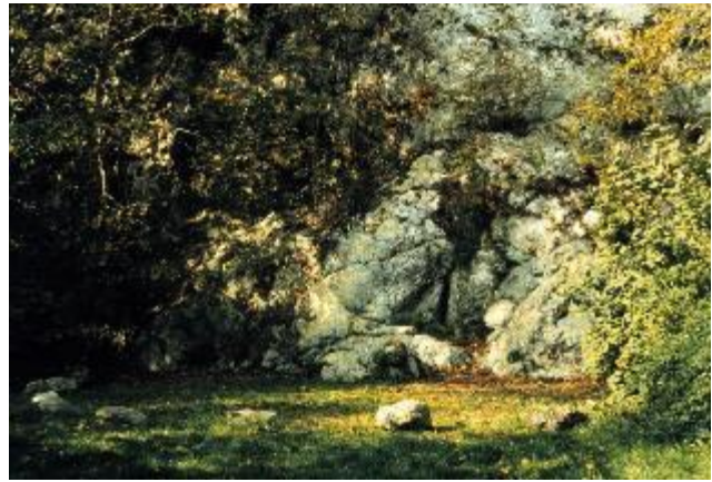
Figure 33. Metacom's seat

A major source of inspiration for this thesis came from a pilgrimage I took, with my mother, to the seat of Metacom in 2013. Metacom's Seat is a site in Rhode Island where Wampanoag sachem Metacomet, also known as King Philip, conducted affairs of state. It's on a little-known and visited rural property owned by Brown University's