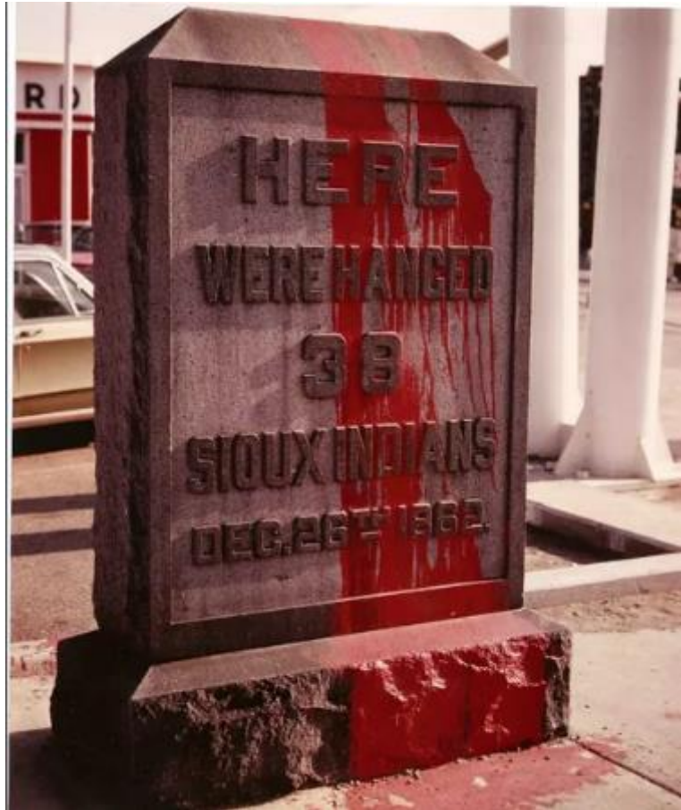
Figure 12. Former monument to the mass hanging of Dakota men in 1862

President Lincoln is one of the most important figures in American history. He is of course credited with keeping the union together during the civil war and abolishing slavery, but the