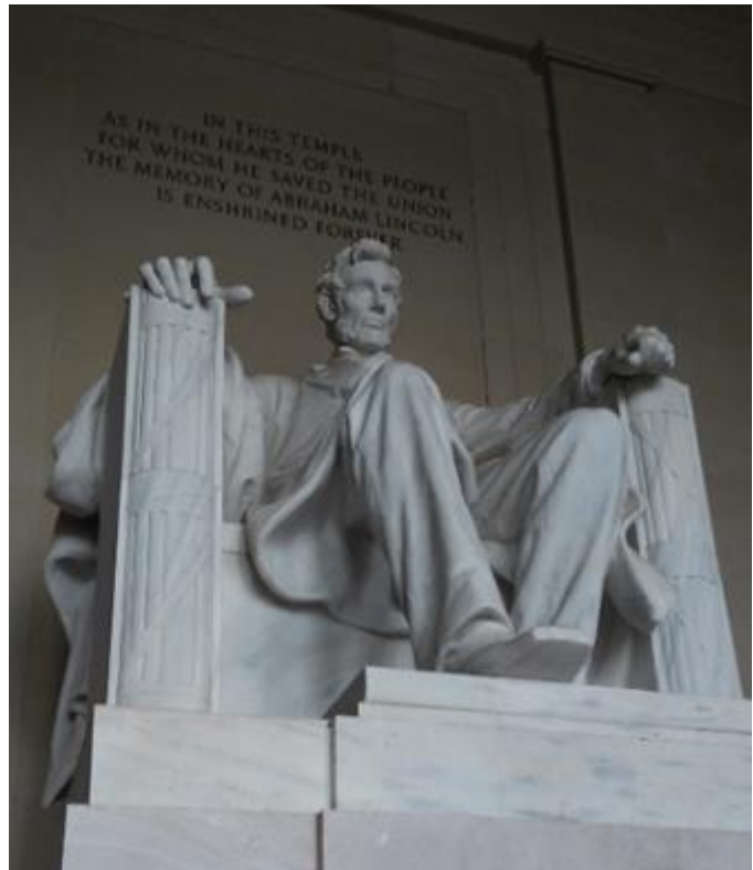
Figure 21. Fasces apparent on arms of Lincoln’s throne, Lincoln Memorial, 2016, Washington, DC

In 2016, I traveled to Washington, DC and visited the Lincoln Memorial with my kids to look for any indication at the monument of his historical legacy on Dakota people. Of course, I found none, but while inspecting the site, I realized that the giant throne he is sitting in has fasces on the arms. Fasces are an ancient Roman symbol of power and authority depicting a bundle of bound rods. “Fasces’ is the root word for ‘fascism,’ a political ideology marked by nationalism, totalitarianism, and imperialism that cast such darkness over global politics in the 1930s and 1940s, most infamously in Germany's Nazi Party, which was modeled on the Italian