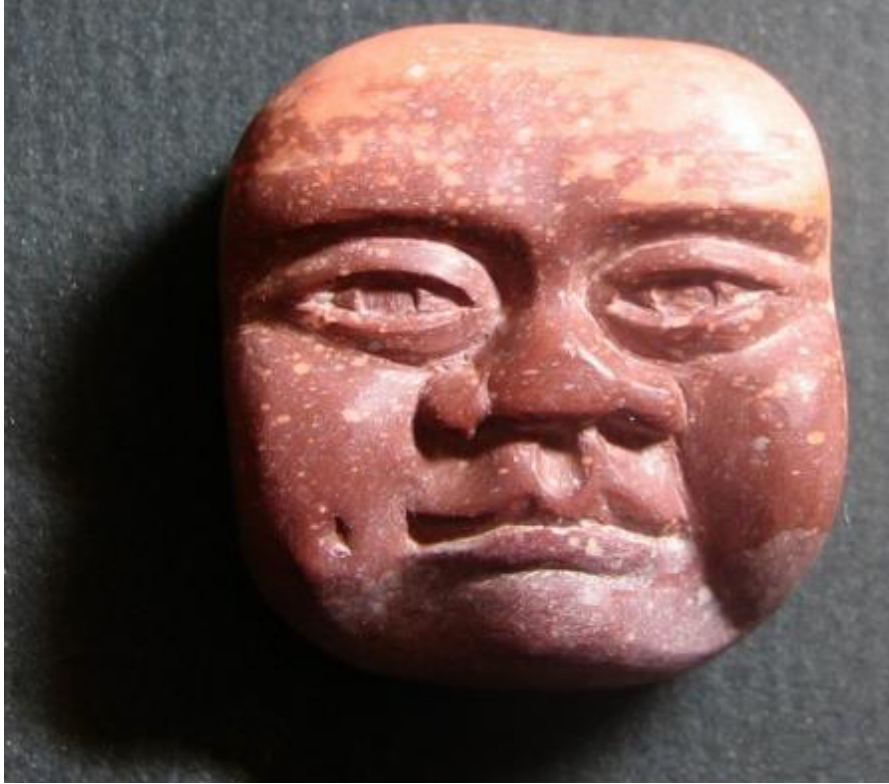
Figure 18. Erin Genia, Canupa Inyan: Girl with a Dimple , 2016, pipestone