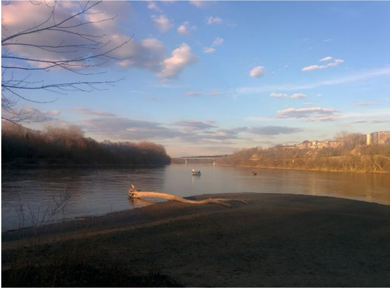
Figure 20. Bdote , 2017, photo by Marlana Myles, St. Paul, MN

Through the act of placing her in the ground at that site, I was participating in a lineage of performative acts of memory. The Dakota Commemorative March was a one-hundred-and-fifty-mile walk to commemorate the forced walk that Dakota ancestors took in 1862. 108 The Dakota 38+2 horseback ride that takes place each year in December, from the Lower Brule Indian Reservation to the site of the mass hanging in Mankato, brings participants together to memorialize the victims of the war. 109 These acts connect the past to the present and bring healing. Of the Dakota Commemorative March , Waziyatawin writes: