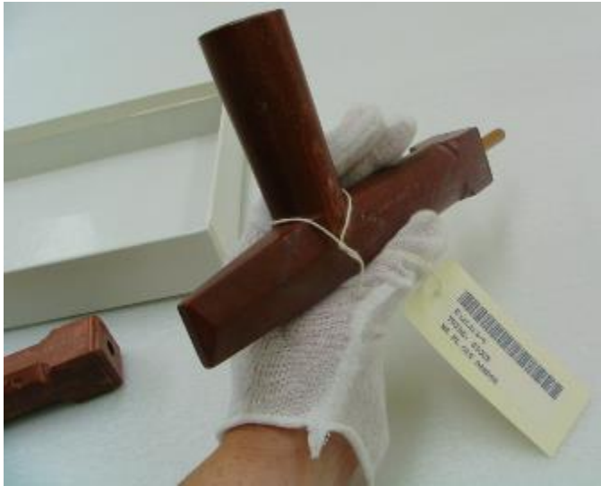
Figure 8. Spirit Lake Treaty Pipe, photo by Erin Genia, 2016 collection of the Smithsonian National Museum of Natural History, Suitland, MD

Treaty signing (now known, and better translated from Dakota, as the Spirit Lake Treaty signing.) 83 It appears that it could have been. Looking at the pipe, there is residue from smoked tobacco in its bowl. This is an example of the nature of the follow-up research that could be done for every piece in every museum collection. Learning about their journeys and origins sheds light on our own, and that is a huge undertaking.