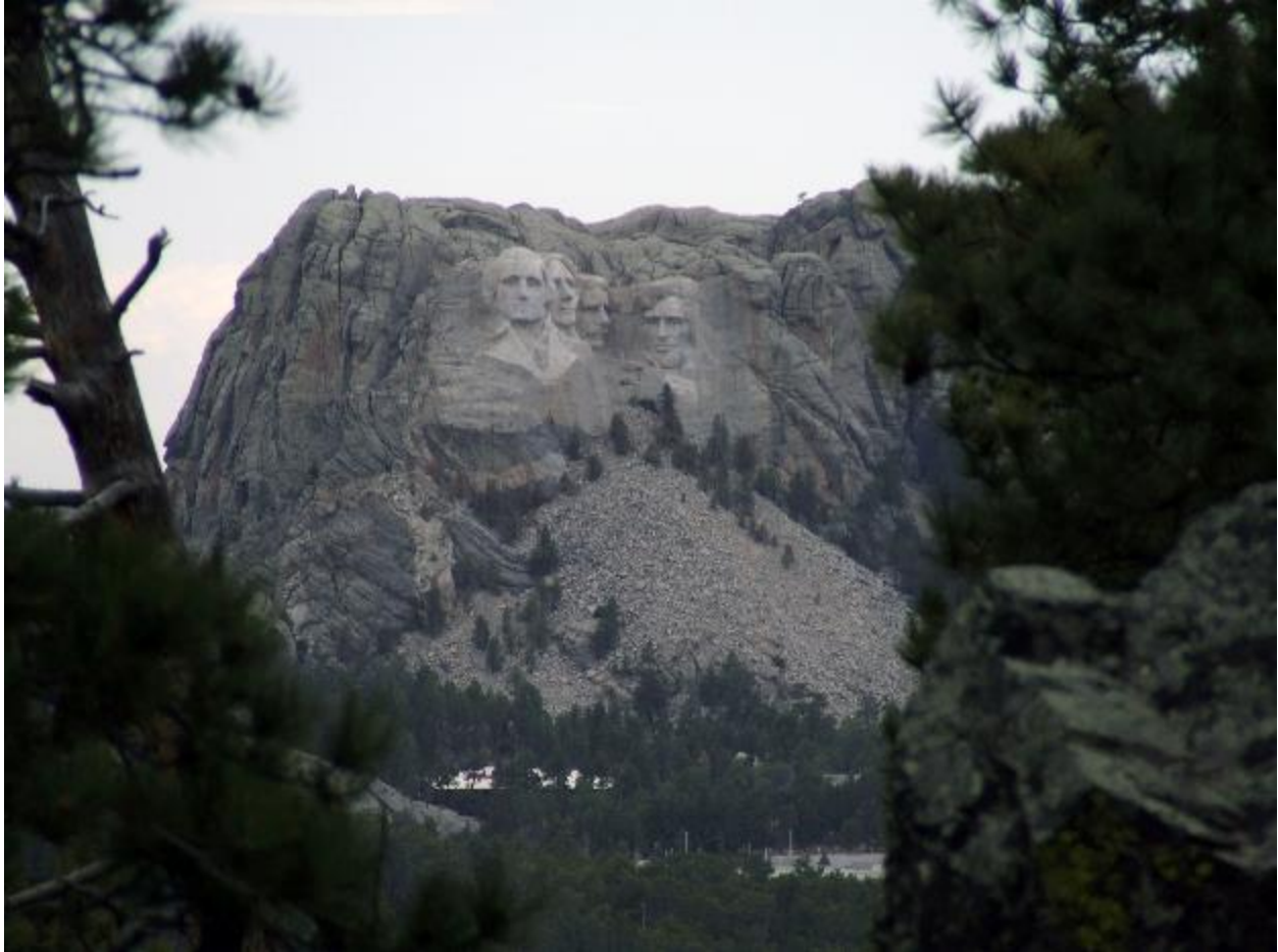
Figure 23. Mount Rushmore National Monument in the Paha Sapa (Black Hills), viewed from Iron Mountain Road, note the pile of debris from carving below it.

Mount Rushmore, Shrine of Democracy , as it is officially known, is a major tourist draw to South Dakota.