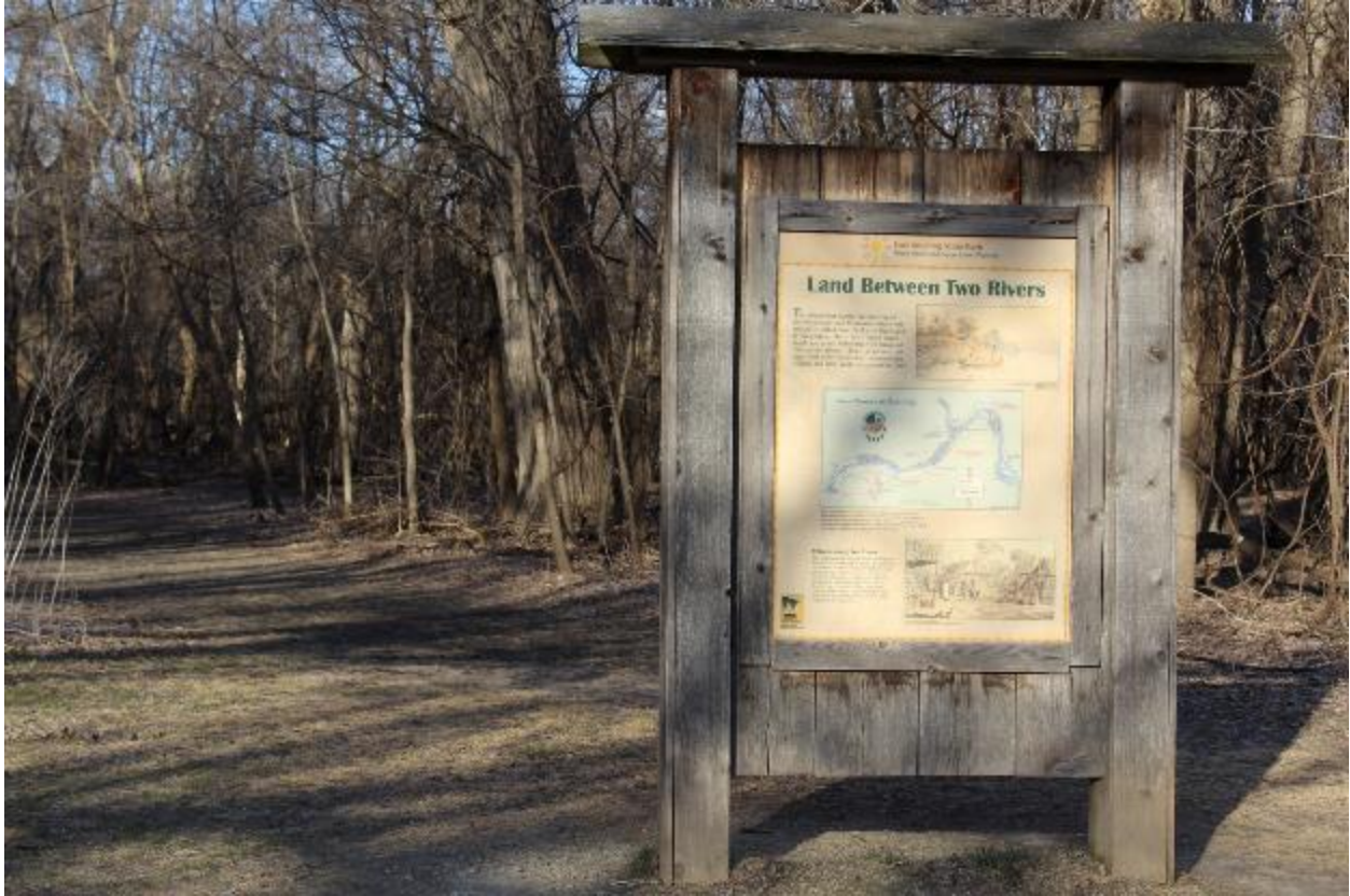
Figure 17. Interpretive Sign at Wita Tanjka, Pike Island, 2017, St Paul, MN

I considered my act of pilgrimage to be both a ceremonial act of healing for myself and as a part of my creative practice. The piece I placed there, Girl with a Dimple , was created to counter the “stoic Indian” stereotype instilled into American culture by Western artists like George Catlin and Edward Curtis. She is a smiling and happy little girl, looking towards the future with hope. I dug a shallow hole in the shoreline at the confluence of the rivers and placed her there, for the ancestors to see.