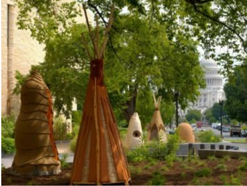
Figure 27. Nora Naranjo Morse, Always Becoming , 2015, Smithsonian National Museum of the American Indian, Washington, DC

Do you consider any impact on local wildlife, water or ecosystem when designing or building a piece for public art?