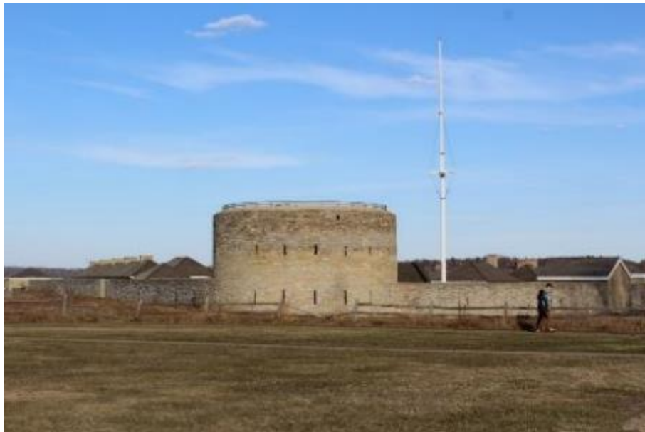
Figure 15. Fort Snelling, 2017, St. Paul, MN