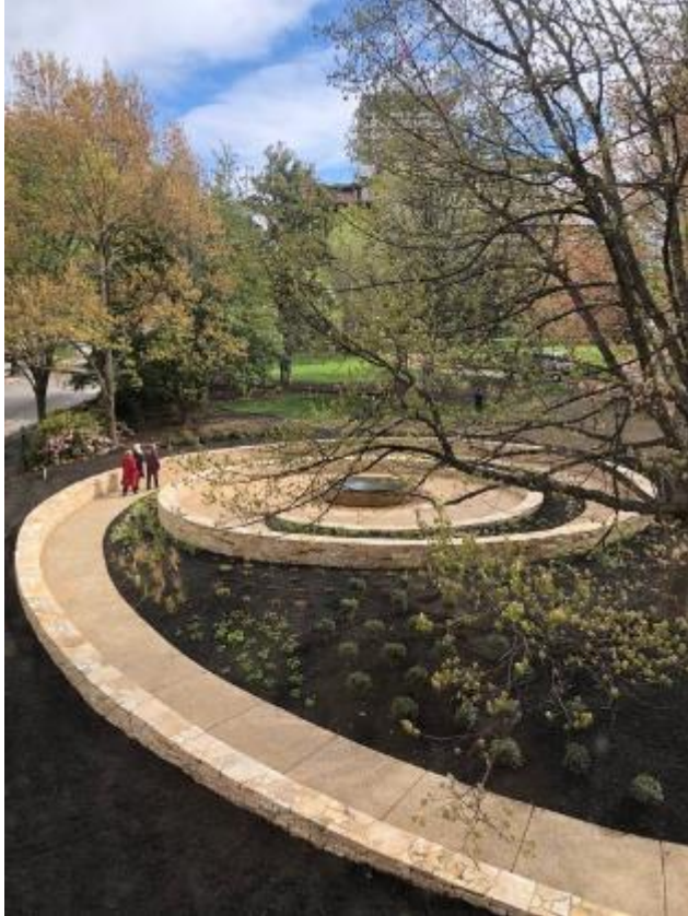
Figure 29. Alan Michelson, Mantle , 2018, Richmond, VA

Do you consider any impact on local wildlife, water or ecosystem when designing or building a piece for public art?