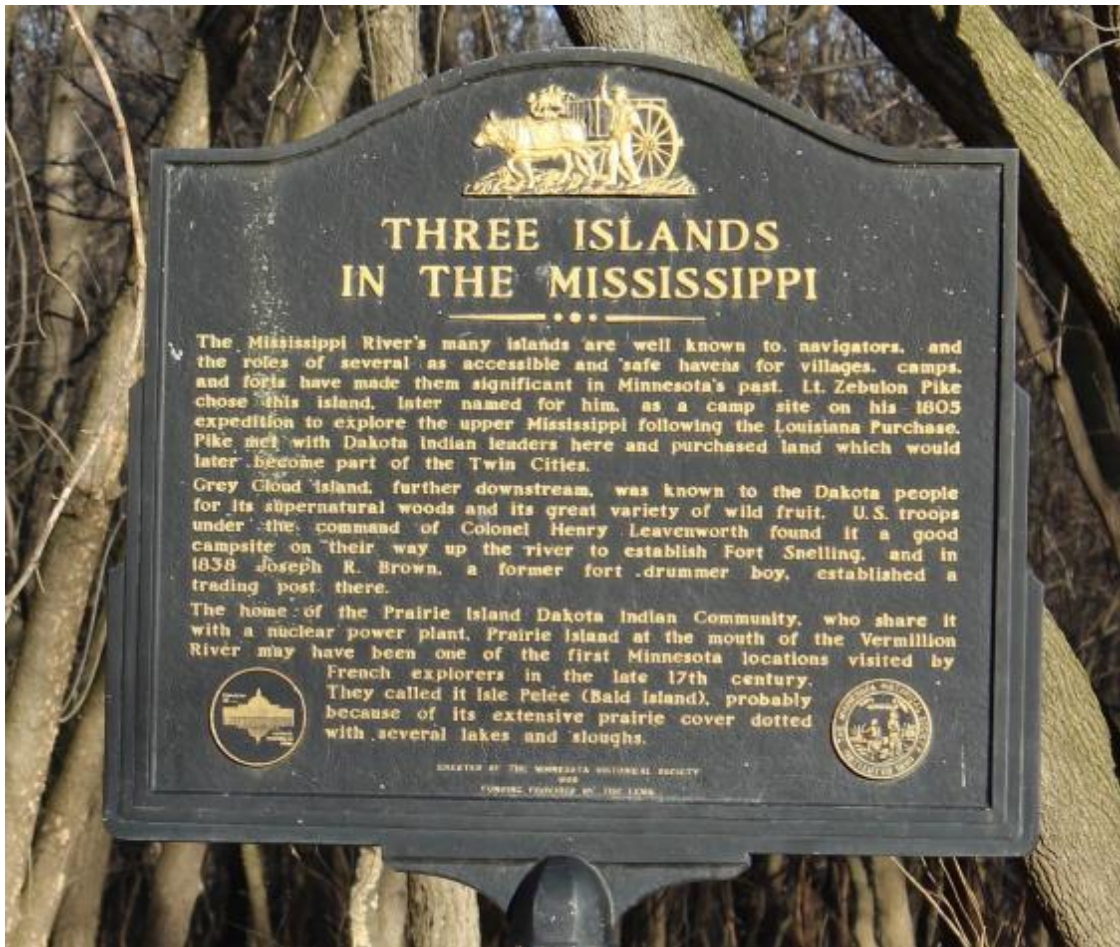
Figure 16. Signage at Wita Tanja, Pike Island, 2017, St. Paul, MN

Marlena led me to Bdote and later said, “There is no signage to tell you where to go—you would have gotten lost without me.” We discussed moves being made to add to the interpretive life of Fort Snelling, Bdote. She said, “There is funding going into changing the space with Dakota people involved, perhaps it can be changed from a tourist destination of a historic military fort to recognizing that it is a sacred place for people.” 107