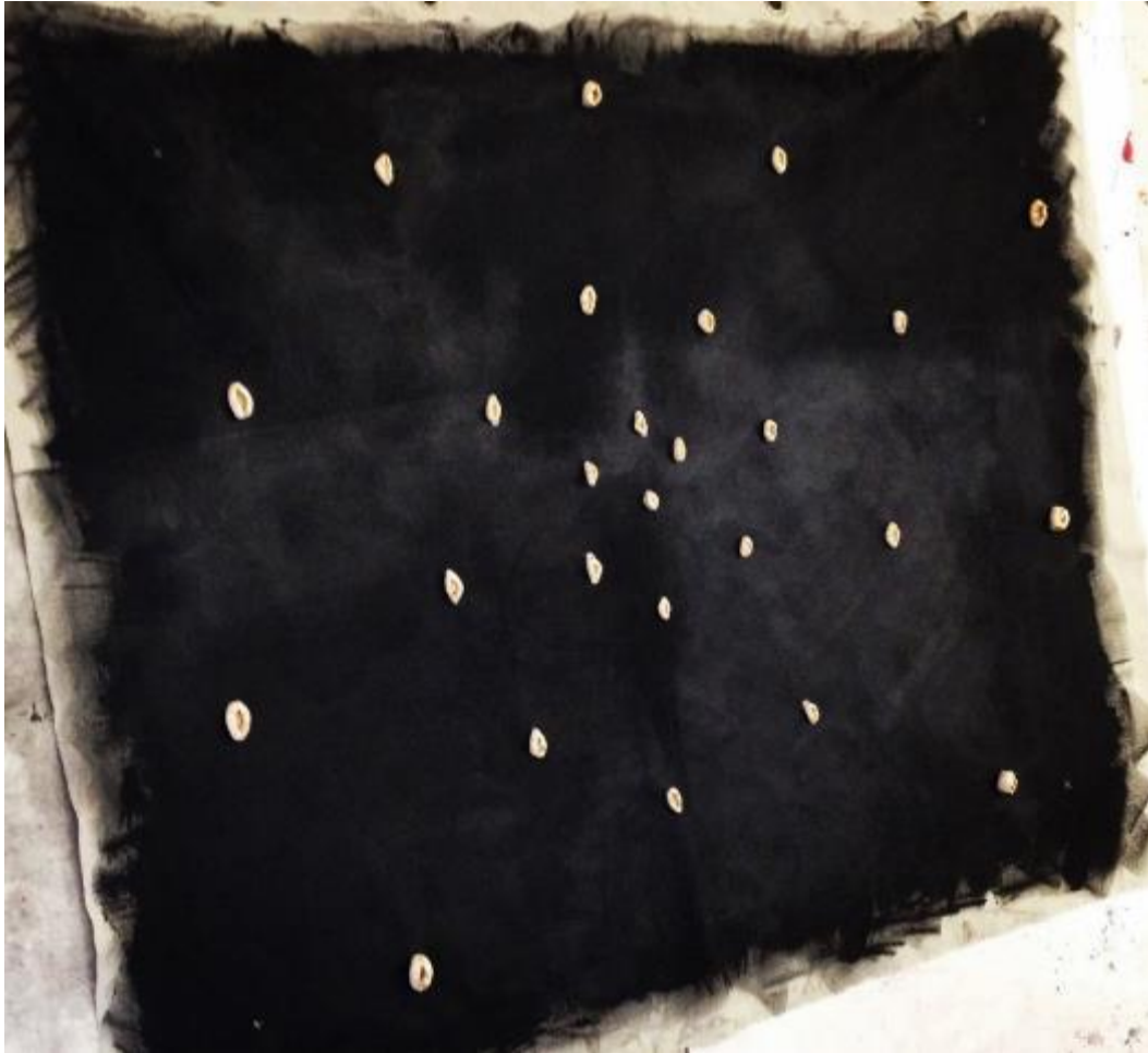
Figure 3. Erin Genia, After Powhatan's Robe , 2018, ceramic, gold leaf, acrylic on canvas

long it must have taken to finish it. My best efforts produced one large spiral – a recurring shape within the artwork described this thesis – in which the shells are spaced to represent culture loss, loneliness, but also continuity.