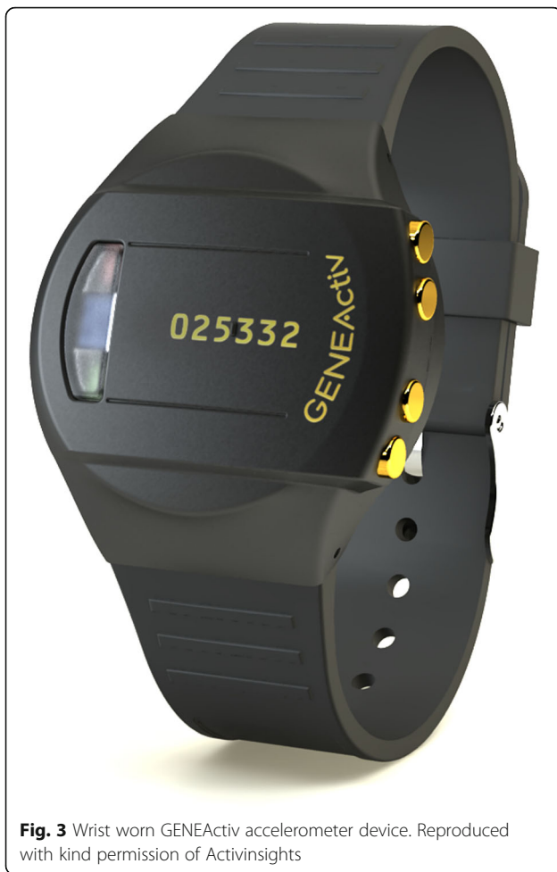
Fig. 3 Wrist worn GENEActiv accelerometer device.

identification of definitive differences. Both Pinto et al. [23] and Berntsen et al. [27] demonstrated that their JDM populations spent less time in MVPA, compared to healthy controls: Pinto et al. reported that their JDM cohort spent 3.7% of each day in MVPA, compared to 4.6% in the control cohort, although this difference did not reach statistical significance (Mann-Whitney U-test p -value > 0.05 ), possibly in part due to the small ( n = 19 ) cohort size. Berntsen et al. [27] demonstrated that their JDM group spent 3.5% of each day in MVPA, compared to 4.2% in the control group (t-test p -value < 0.01 ). Berntsen et al. also demonstrated a significantly lower CPM level in their JDM group, compared to the control group: 351 vs 423 CPM, respectively (Wilcoxon signed rank test p -value < 0.01 ). Mathiesen et al. [22] reported mean counts per minute from a JDM cohort – 513 in those younger than 18 years. Although they did not directly compare these findings with a healthy control population within the same study, they did compare against reference values from a study of healthy 9 and 15 year old children by Andersen et al. [33], who reported