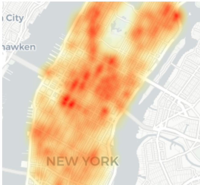
Fig. 1: A cropped view of the initial vehicle distributed needed to service all of the taxi demand in Manhattan for a particular day

In what follows, we address the problem of determining how many vehicles are needed and where they should be for a MoD fleet to service all the taxi demand at city-scale with a maximum waiting time and maximum incurred delay while allowing multiple requests to be serviced by the same vehicle. We show that optimizing the number of vehicles and their distribution, we can significantly improve the efficiency of a MoD fleet.