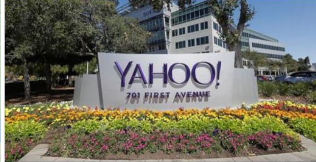
Yahoo Suffers World's Biggest Hack Affecting 1 Billion Users Yahoo has discovered a 3-year-old security breach that enabled a hacker to compromise more than 1 billion user accounts, breaking the company's own humiliating record for the biggest security breach in history. The digital heist disclosed Wednesday occurred in....