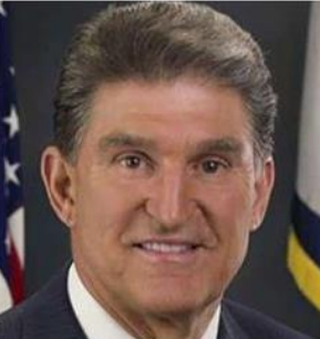
Dems scramble to prevent their own from defecting to \ensuremath{\mathsf{Trump}}

President-elect Donald Trump's threat of retribution against companies that move jobs out of the U.S. is already having the effect he probably intended: some business leaders are... MSN.COM