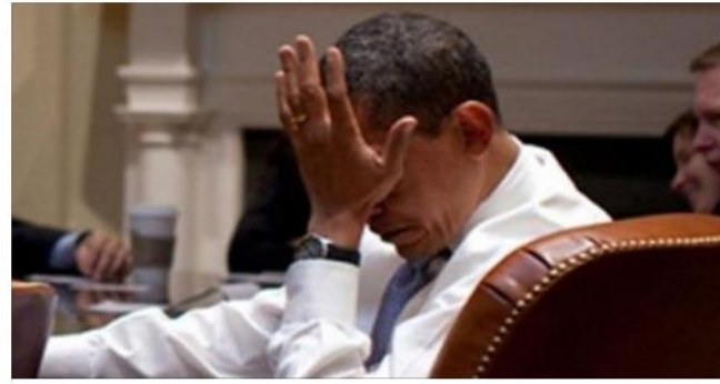
Obama Was Going To Castro's Funeral—Until Trump Told Him This...

Obama just had the rug pulled out from under him.