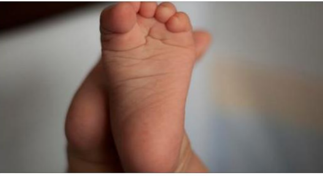
Woman who had ovary frozen in childhood gives birth

She is believed to be the first woman in the world to have a baby after having ovarian tissue frozen before the onset of puberty