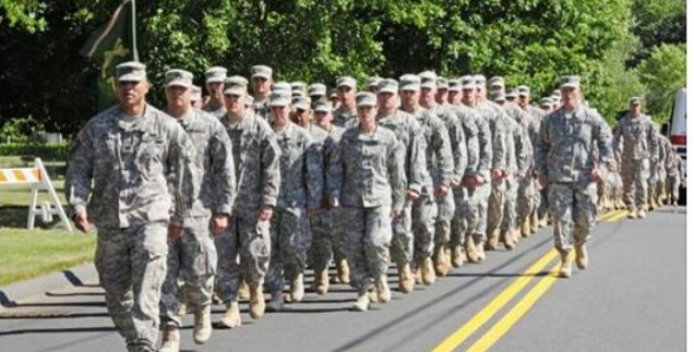
Trump on Revamping the Military: We're Bringing Back the Draft