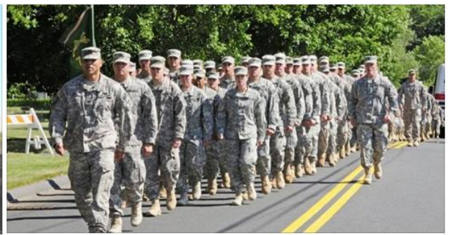
Trump on Revamping the Military: We're Bringing Back the Draft