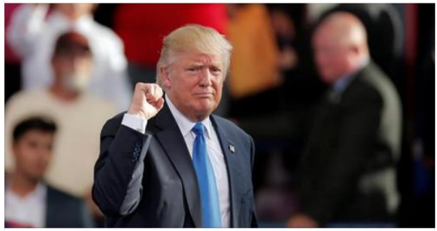
Donald Trump on refusing presidential salary: "I'm not taking it"