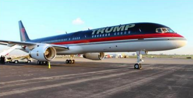
Donald Trump Sent His Own Plane To Transport 200 Stranded Marines

PHOENIX A.Z. (AP) — For months now, rumors have circulated the Internet that individuals were being paid to protest at rallies held by presidential hopeful Donald Trump. Today a... ABCNEWS.COM.CO