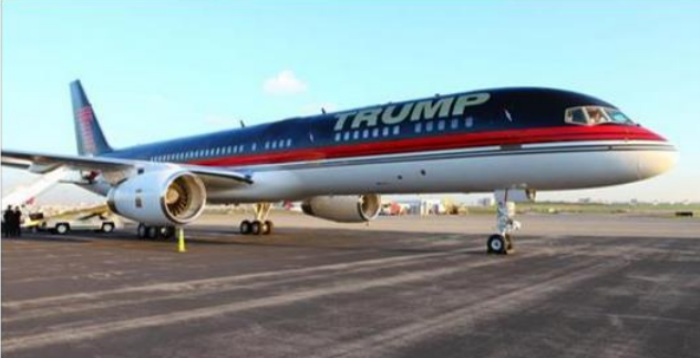
Donald Trump Sent His Own Plane To Transport 200 Stranded Marines