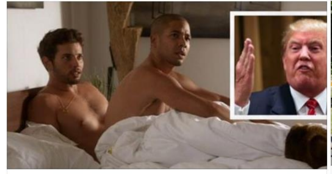
Trump to Ban All TV Shows that Promote Gay Activity Starting with Empire as President – The #1 Empowering Conscious Website In The World