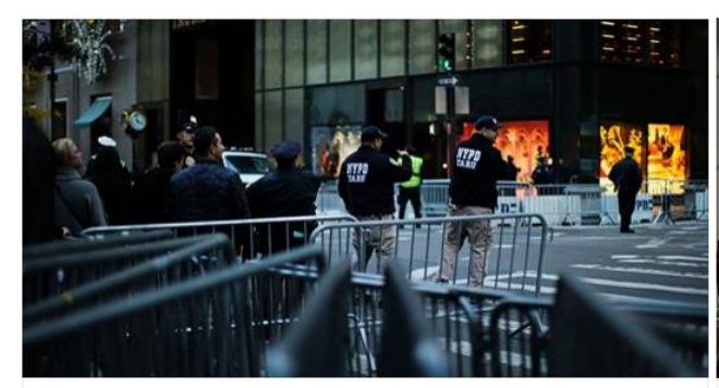
The Small Businesses Near Trump Tower Are Experiencing a Miniature Recession