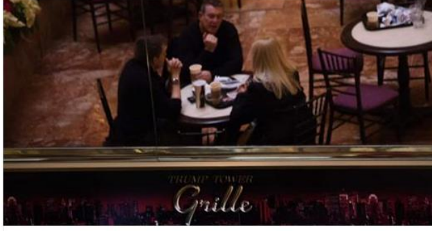
Trump Lashes Out At Vanity Fair, One Day After It Lambastes His Restaurant