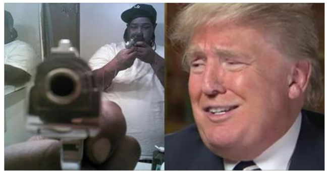
BLM Thug Protests President Trump With Selfie...Accidentally Shoots Himself In The Face * Freedom Daily Cant fix Stupid...