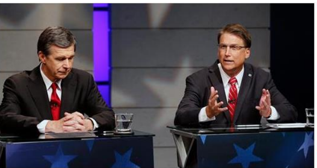
North Carolina Republicans Push Legislation To Hobble Incoming Democratic Governor

The bills are "petty," one Democratic state lawmaker said.