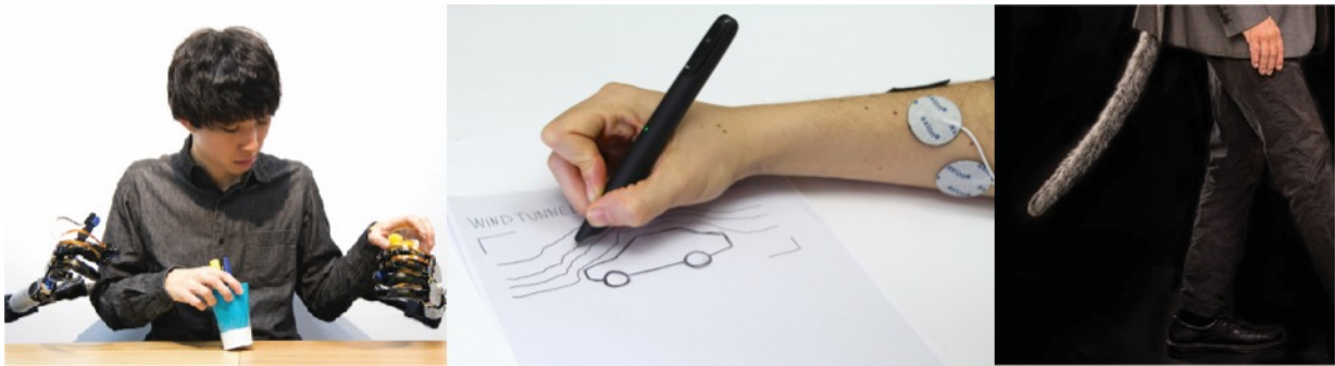
Figure 1. Exemplars of Human-Computer Integration: extending the body with additional robotic arms; [71] embedding computation into the body using electric muscle stimulation to manipulate handwriting [49]; and, a tail extension controlled by body movements [87].