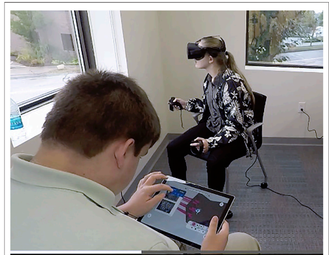
FIGURE 3 | Two players using the collaborative version of Cellverse .

One very common theme throughout our user interviews was that Cellverse was more “hands-on” than other cell biology learning experiences that the participants had experienced. Indeed, experiencing the game helped students engage with an abstract concept by directly interacting with or manipulating the virtual environment (As mentioned earlier, a high level of presence may have also helped to contribute to this “hands-on” feeling ubiquitous among users.) The ability to interact with the microscopic VE through a microbot and nanobot may have enabled users to make more authentic mental models of cells. This was evidenced by how organelle frequencies and the level of complexity increased in VR users’ cell drawings after playing Cellverse (Figure 3). These drawings provide visual evidence of users’ shifting mental models, particularly as many users came to