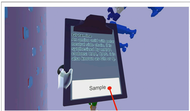
FIGURE 2 | Screenshot of clipboard tool showing a user sampling glutamine, an amino acid.

Figure 2. Finally, players are capable of shifting their viewing robot between microscale (the microbot’s original scale) and nanoscale (a smaller nanobot) in order to view particles of different sizes. By approaching the rough endoplasmic reticulum (ER), they can activate a nanobot that enables them to “shrink” to nanoscale and observe macromolecules (e.g. RNA and amino acids) that would not be visible at the microscopic (or micro) scale.