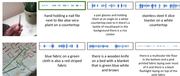
Figure 2: Top 3 retrieved audio captions for two sample images. The true caption for the image is boxed in green.

Because Spoken ObjectNet is best understood as a test set relative to a dataset like Places Audio [3], our experiments are based on these two datasets. We also created a split of Places Audio that is the same size as Spoken ObjectNet, with 48,273 training samples randomly selected from the original 400k and the same 1,000 sample validation set as the original Places Audio. This split allows us to control for data quantity in our experiments, and we refer to the split as Places-50k and to the full training set as Places-400k. All experiments used the datasets’ training sets to train models and the validation sets to evaluate models (as Places Audio does not have a predefined test set).