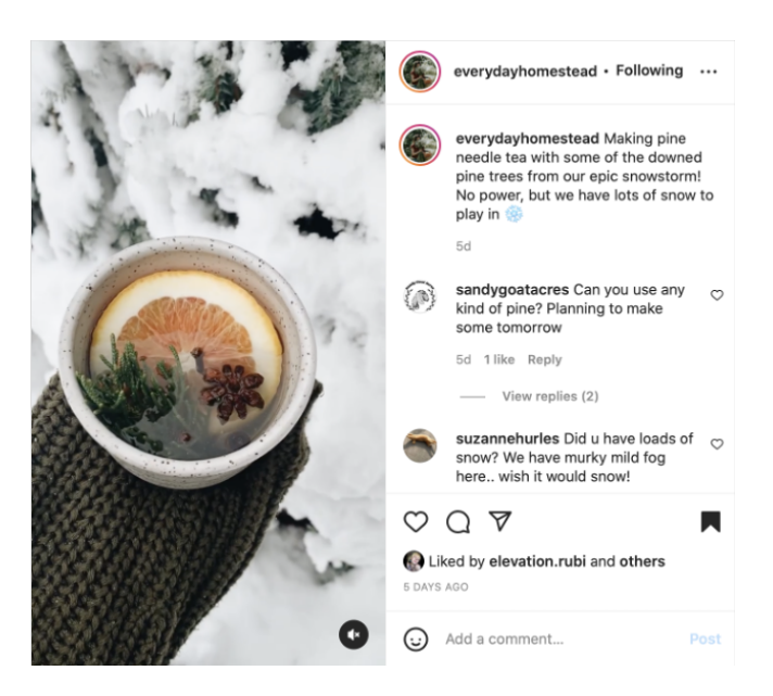
Figure 7. An Instagram post showing a sleeved hand holding a mug of pine needle tea.

Westerville, Ohio— Delicate snow flurries sweep past the windows in my parents' living room. It's January 2, 2022 and about 30 degrees Fahrenheit outside, but closer to 70 degrees inside, with the gas fireplace on. Inside and tucked under a blanket, I'm enchanted by the scenery. To me, this is an ideal moment in which to go foraging for pine needles that I can use to make into a tea. Ever since seeing an Instagram post featuring a cozy cup of pine needle tea several weeks ago, I've been planning to make some while I'm home with my parents over the holidays.