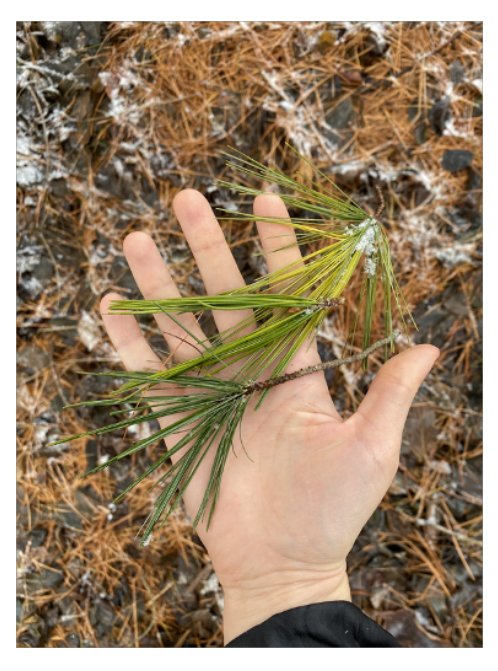
Figure 8. My hand holding foraged pine needles.

Coming up close to the trees, I realize I don't know whether and how to harvest pine needles