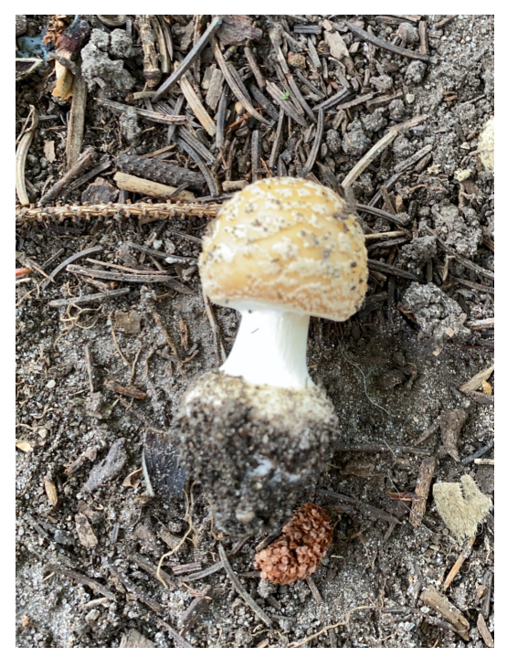
Figure 4. The mystery mushroom.

Cambridge, Mass. — It's September 23, 2021, a Thursday, and "trash day" on my street. I was wheeling the newly-empty recycling bin from the street to my backyard when I noticed three pale mushrooms just barely peeking out of the damp earth in my yard. I had learned on the Facebook foraging group page that in New England, one could expect a flush of mushrooms in the days following rainfall, so I had