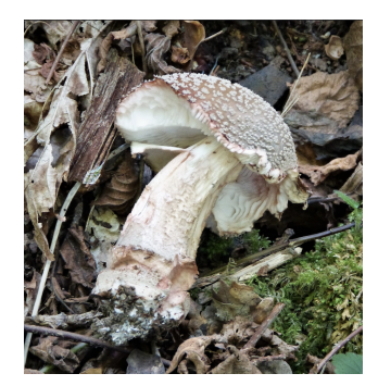
Figure 5. Mushrooms tagged as Amanita rubescens , from First Nature, iNaturalist, and Flickr.

According to First Nature's website, the Amanita rubescens is also referred to as the "Blusher" because, when its flesh is damaged or cut, the flesh turns from white to a pinkish red. I took a paring knife out,