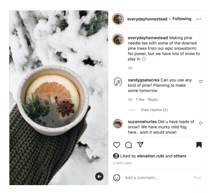
Figure 7. An Instagram post showing a sleeved hand holding a mug of pine needle tea.

Westerville, Ohio— Delicate snow flurries sweep past the windows in my parents' living room. It's January 2, 2022 and about 30 degrees Fahrenheit outside, but closer to 70 degrees inside, with the gas fireplace on. Inside and tucked under a blanket, I'm enchanted by the scenery. To me, this is an ideal moment in which to go foraging for pine needles that I can use to make into a tea. Ever since seeing an Instagram post featuring a cozy cup of pine needle tea several weeks ago, I've been planning to make some while I'm home with my parents over the holidays.