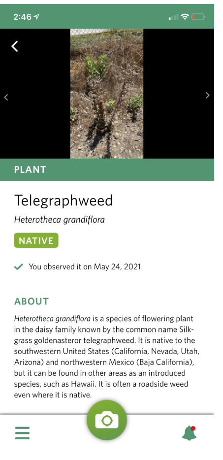
Figure 1. Telegraphweed's profile, on the Seek by iNaturalist app.

Pasadena, Calif.— The midmorning air smells of desert dust. It's around 10 A.M. Pacific Time on May 24, 2021 and it's already about 79 degrees Fahrenheit outside. Under the sun's glare, I walk the rocky path along the Arroyo Seco (Spanish for "dry creek," according to Google Translate) trying to find a plant whose name I already know. Very little looks familiar, although I've walked here many times