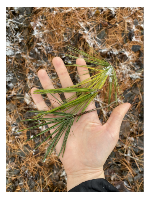
Figure 8. My hand holding foraged pine needles.

Coming up close to the trees, I realize I don't know whether and how to harvest pine needles