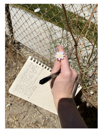
Figure 3. Here, I am holding my notebook, pen, and a Cliff Aster flower.

I'm starting to feel a little too sweaty, hot, and overwhelmed by all of the organisms that I have yet to photograph using Seek. It seems like the more species I try to identify using the app, the more new