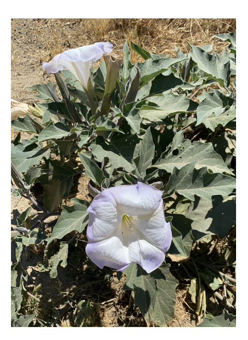
Figure 2. Sacred datura.

As I carefully look at the plants, snap photos, and take notes on my journey, I become more