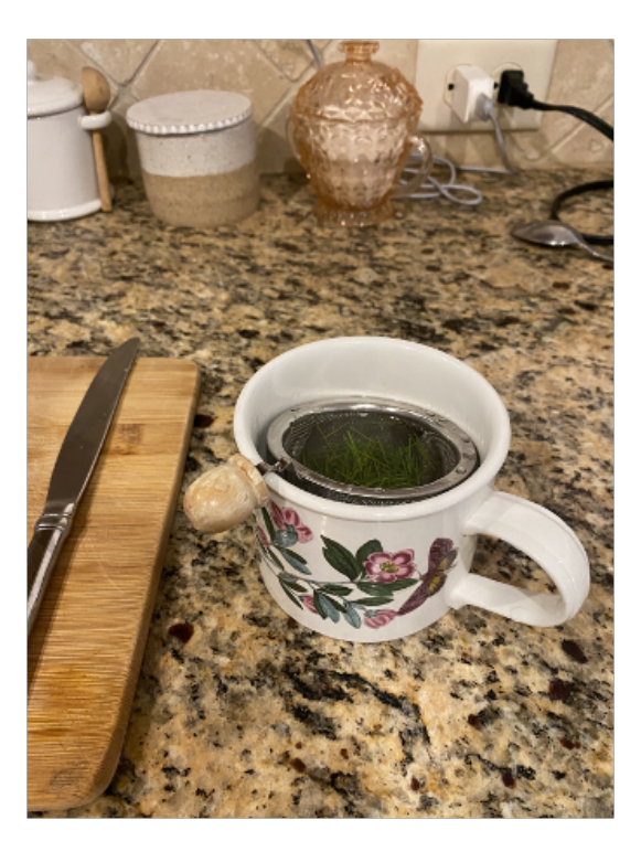
Figure 9. My cup of pine needle tea.

warnings to watch out for Yew and some other flat-needled pines, which can poison humans. I go into the kitchen, rinse off the pine needles, and chop them into short segments while a water kettle heats up. After setting a tea strainer in a coffee cup, I fill the strainer with the chopped needles, and then pour the steaming water over them. I let the tea steep for several minutes and then cool off. Remembering Casey's advice not to consume very much of anything for the first time, I take a tiny sip. The flavor is delicate and pleasant, although difficult to describe or compare to other things I've tasted. My mom and dad take tiny sips, too. Having had this