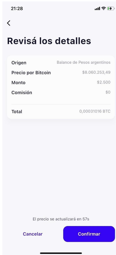
Figure 5: Belo's Transaction Review Screen

As I returned to the home screen, my large currency number displayed $2419.0237, and below it said I had 0.00031016 BTC. I briefly wondered why this was the case, as I had transferred $2500, but I then realized that this was because the purchasing price of bitcoin is higher than the selling price. The confusion nevertheless shed light on how I was not given the chance to compare prices or scrutinize if the price of bitcoin that the app offered me was correct. Belo acted as my cryptocurrency wallet, but also as my exclusive broker.