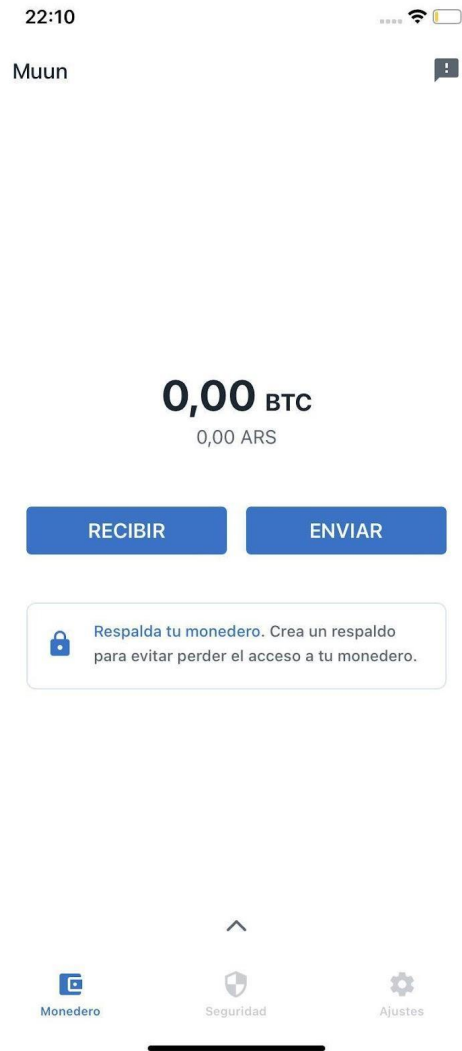
Figure 2: Muun’s Home Screen

When selecting “Recibir” (“receive”), the user is greeted by a screen (Figure 3) that shows a QR code and a clipped string, which is the user’s address. The user can select between “Bitcoin” and “Lightning,” referring to whether the transaction will run on the Bitcoin network or the Lightning Network (a network that is generally faster and demands less transaction fees but is often seen as less secure and has other limitations). The user can either display this QR code for another user to scan with their phone or use the two highlighted buttons to either share (using the phone’s operating system’s sharing menu) or copy their address to the clipboard. The user