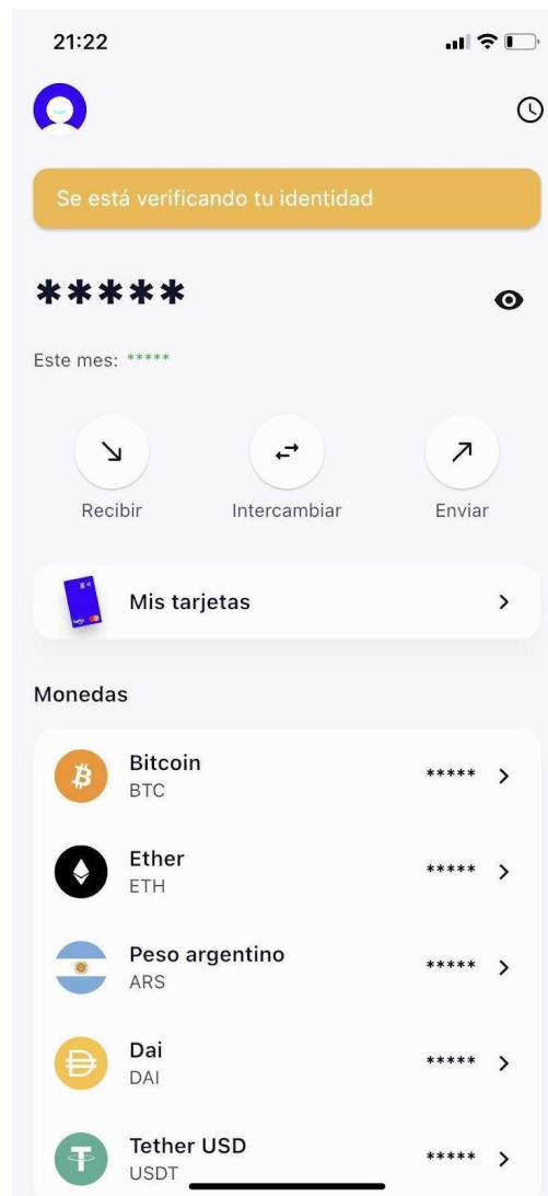
Figure 4: Belo’s Home Screen, Validation Pending

Three minutes later, I received a notification saying my identity had been validated and that I could now make transactions, hinting at how the process likely relied on automation.