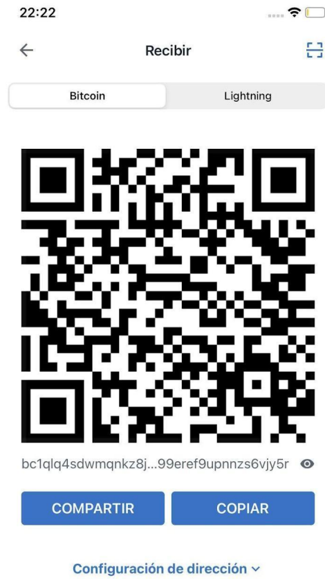
Figure 3: Muun's "Recibir" Screen

can also change the address settings by selecting an amount to be received and an address type (Legacy, Segwit, or Taproot), including explanations of each standard.