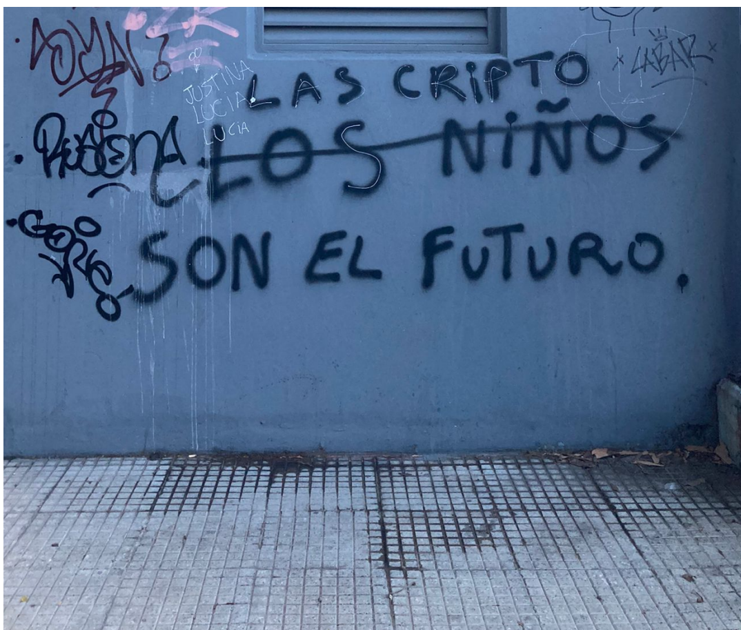
Figure 1: A Graffiti in Colegiales

In July of 2021, a friend sent me an image through WhatsApp: a photo of graffiti in Colegiales, a neighborhood in Buenos Aires, that read “ los niños las cripto son el futuro,” “ children cryptos are the future” (Figure 1). I had long been reading about blockchains and DAOs (decentralized autonomous organizations) and had been intellectually drawn to the hype surrounding this technology. The graffiti did pose something new to me, however. For the person who made the graffiti, cryptocurrencies were the future. I wondered what cryptocurrencies meant for them: certainly, more than just money.