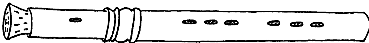
A typical keyless flute