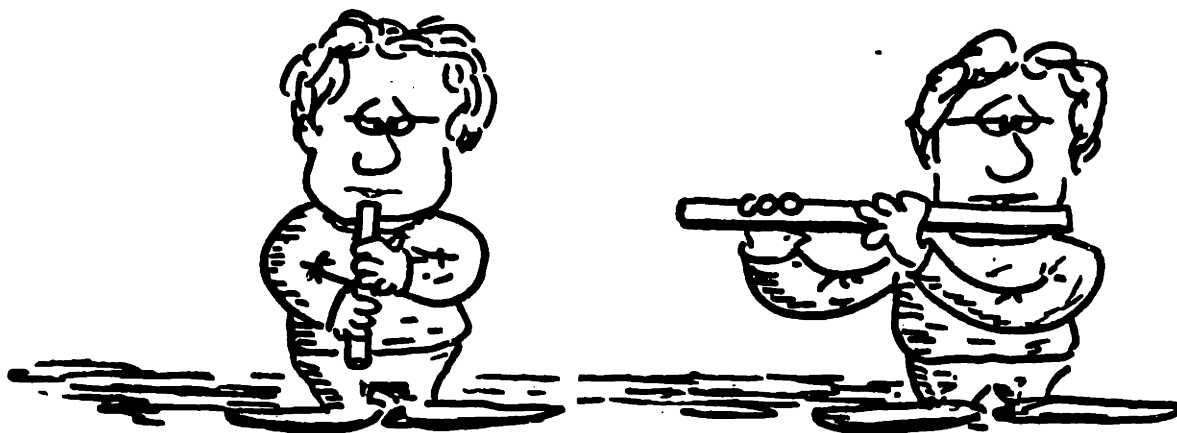
The vertical flute

The embouchure hole is usually located on the side of the tube, with that end of the tube itself stopped. There are, however, "end blown" flutes, such as the Japanese "Shakuhachi" flute or the ancient "nay", most likely the flute of King David. With an end blown flute, the player holds the instrument vertically--the most natural posture for blowing across an embouchure hole at the end of the tube. When the embouchure hole is on the side of the instrument, it is held horizontally (again, the most natural posture); therefore, such flutes have been called "transverse" flutes.