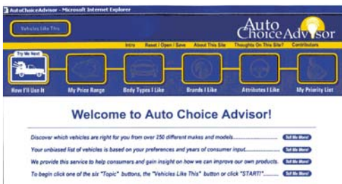
Figure 1 Site Designs

We focus on these critical managerial Web site design issues. Although most managers agree and understand that factors such as privacy and security affect consumer perceptions of trust in a Web site, they need a better understanding of how these other aspects of the Web site affect trust and the consequences of online navigation on the site affect consumers’