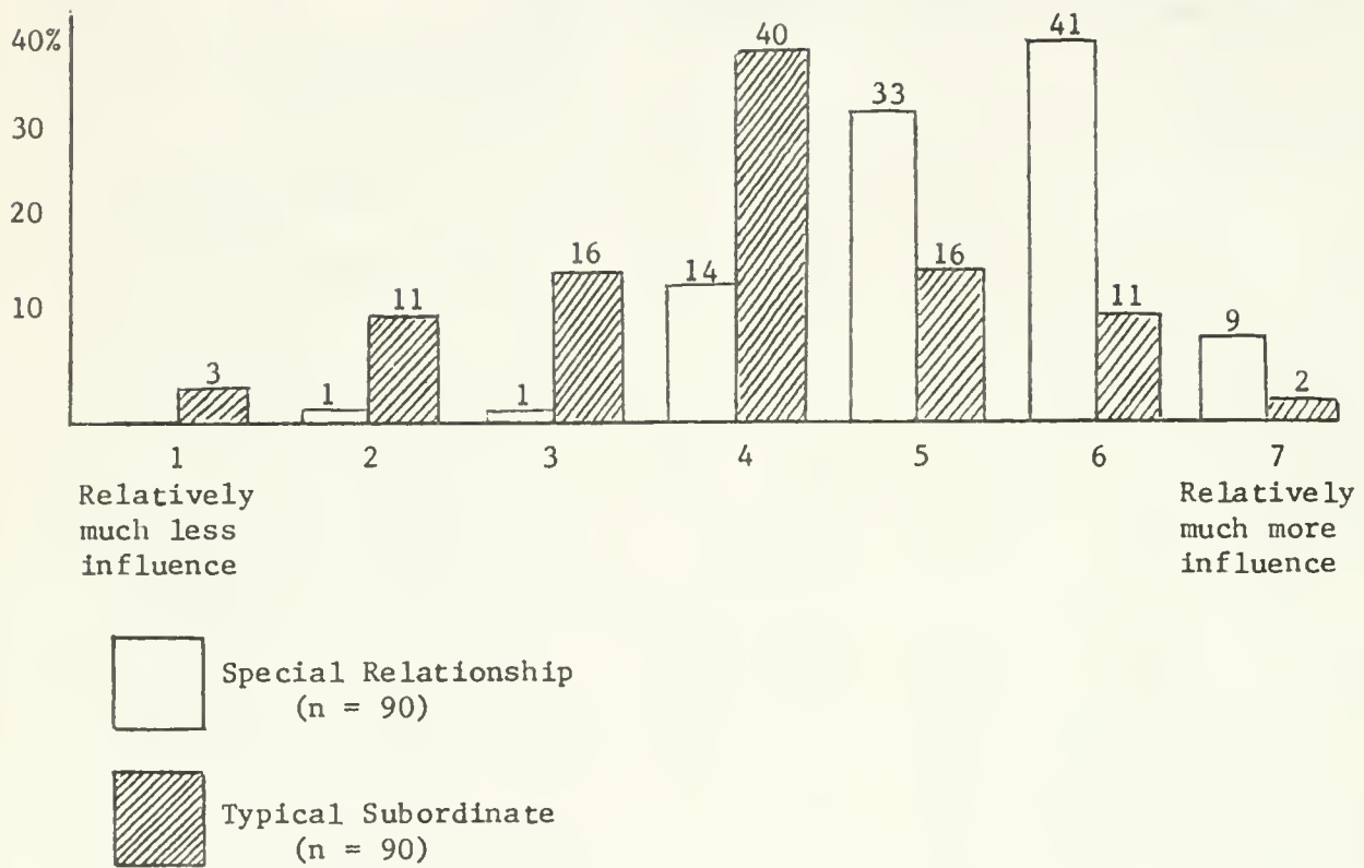
Figure 1. Career Influence. Percentage distribution of responses for Special Relationships and Typical Subordinates.