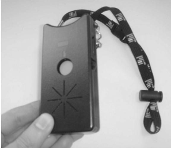
Figure 1 Portable sensory platforms (Social Badges) used to collect personal communications data

These devices measure just a few centimeters (see Figure 1), are equipped with various sensors and record the personal communication and interaction structure of the employees wearing them. Infrared sensors embedded in the Social Badges identify face to face meetings between two candidates. A Bluetooth unit evaluates the position of a person within the building and how far apart the candidates are. An acceleration sensor records movement speeds. Finally, a speech sensor evaluates who has spoken, how much they have spoken, and when. In most cases, evaluating the pitch allows conclusions on the emotionality of the conversation. (The speech sensor was not used in our study.)