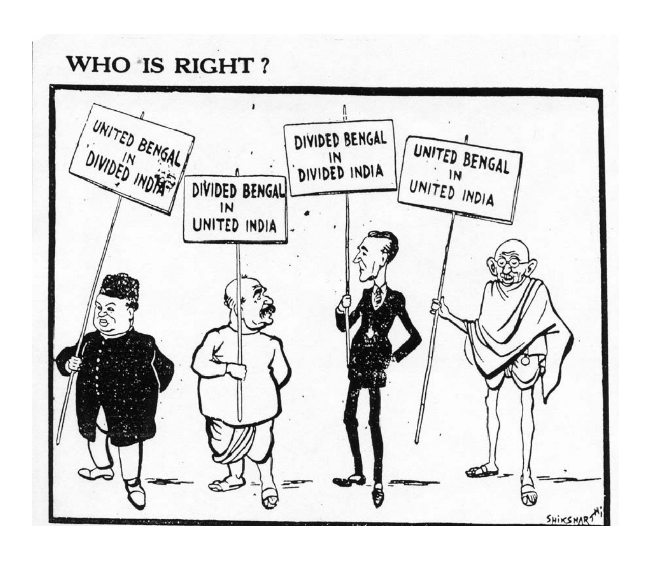
HS, May 17, 1947, 5.