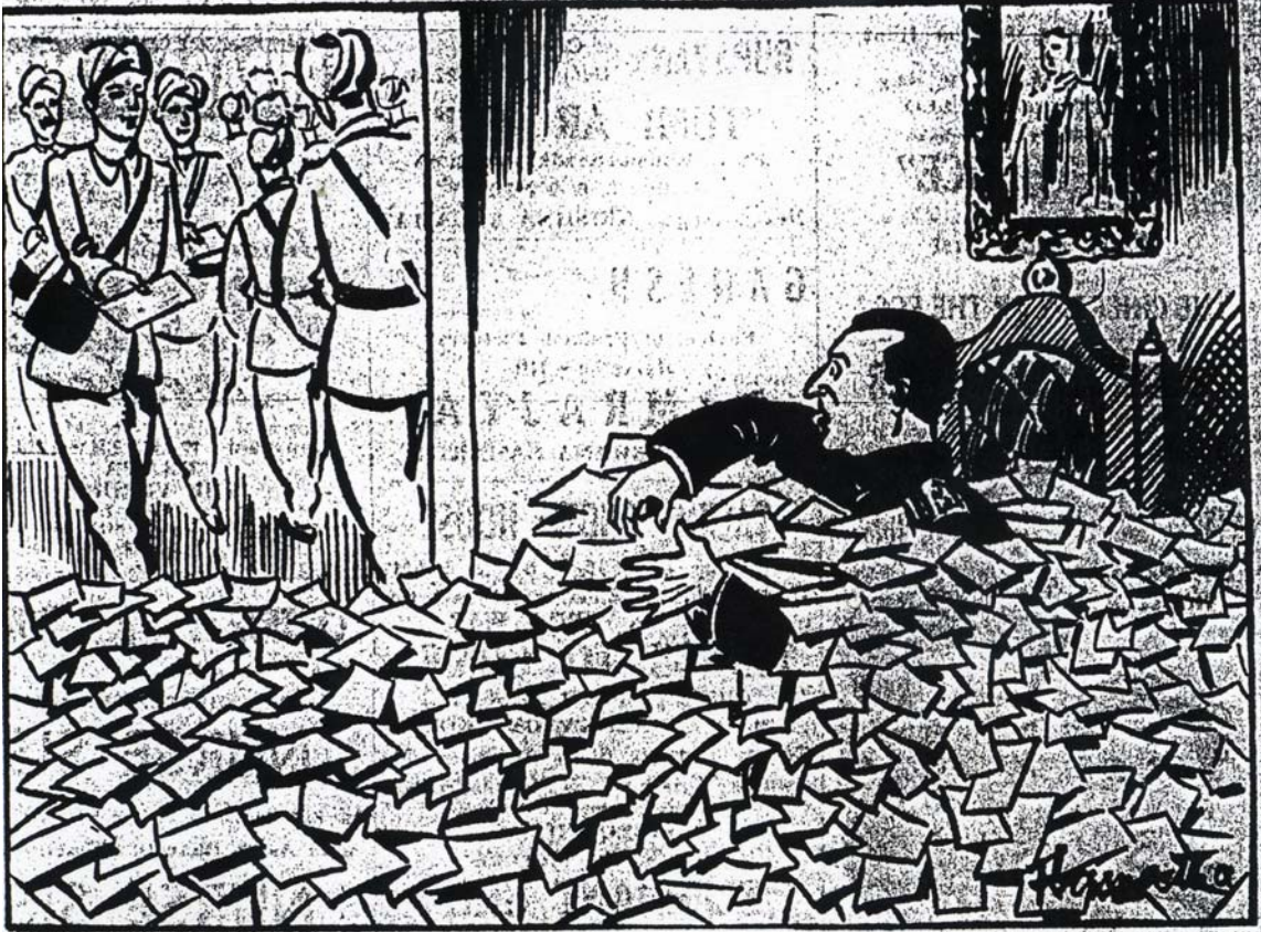
The Viceroy is reported to have been overwhelmed by nearly 10,000 telegrams demanding partition of Bengal.