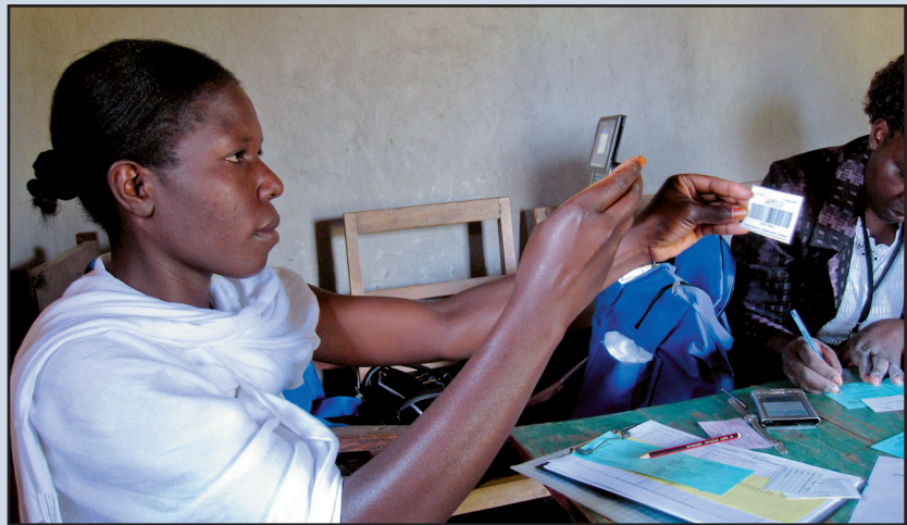
Figure 2. An HCT counselor scans a patient's demographic information into ODK Collect.

Over the next two years, HCT counselors will use 300 Android phones equipped with ODK Collect to reach millions of people in Western Kenya. They will be free to customize and extend ODK as they