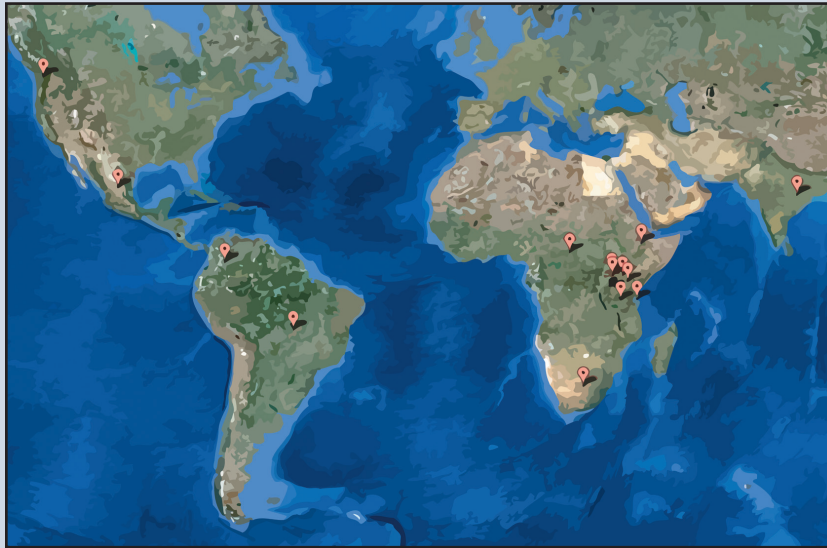
Figure 1. Examples of ODK deployments include deforestation monitoring in the Amazon, decision support for pediatrics patients in Tanzania, documenting war crimes in the Central African Republic, and monitoring school attendance in India.