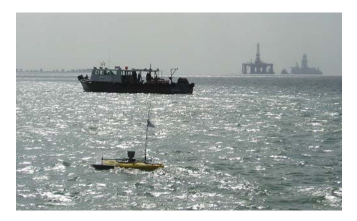
Fig. 1. Autonomous marine vehicles are employed in Singapore Harbor for environmental sensing and modeling, through the Singapore-MIT CENSAM Program. Singapore Harbor presents an extremely challenging environment for such operations, with strong, variable currents and winds, and heavy shipping traffic.

The objective in the present paper is to explicitly take the assimilation step into account in path planning; we develop the problem statement in the next section. In comparison with the above works, our method allows a complex trajectory and vehicle dynamics, with a somewhat simplified field variable model. Such a low-order modal model is appropriate for