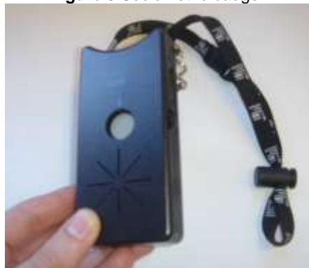
Figure 3 Sociometric badge.

The design of the sociometric badges was motivated by the fact that a large number of organisations already require employees to wear RFID name tags that identify them and grant them access to several locations and resources. These traditional RFID name tags are usually worn around the neck or clipped to the users clothing. With the rapid miniaturisation of electronics, it is now possible to augment RFID badges with more sensors and computational power that allow us to capture human behaviour without requiring any additional effort on the users side. By capturing individual and collective patterns of human behaviour with sociometric badges and correlating these behaviours with individual and group