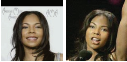
(a) Examples of one individual from LFW.