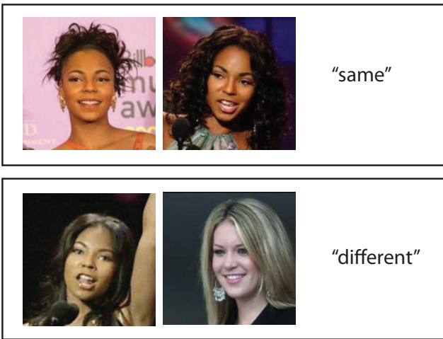
(b) Examples of “same” and “different” pair of faces in LFW.