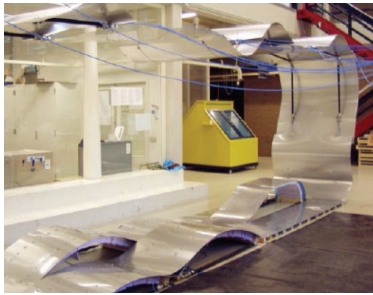
figure 1. Re-configurable architectural spaces [4].