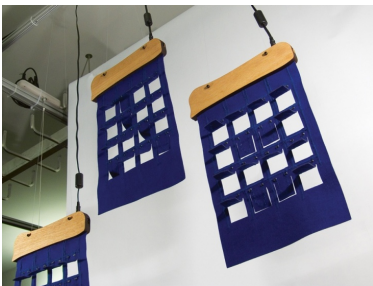
figure 4. Shape changing textile surface for environmental control and communication [1].

resolution, full-color, interactive graphics? There are few early projects that explored these possibilities [5] suggesting that the design of interface elements and mappings should follow the 3D physical shape of the display itself: form of the display equals its function .