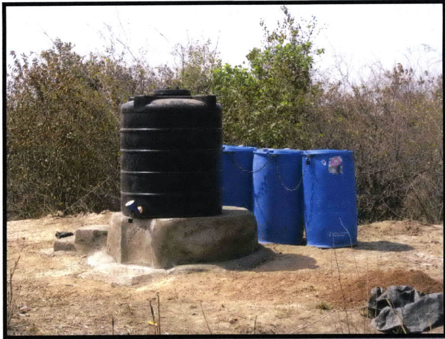
Figure 2: Community Water Solutions Treatment Center, Nyamaliga

One such treatment center is pictured below: