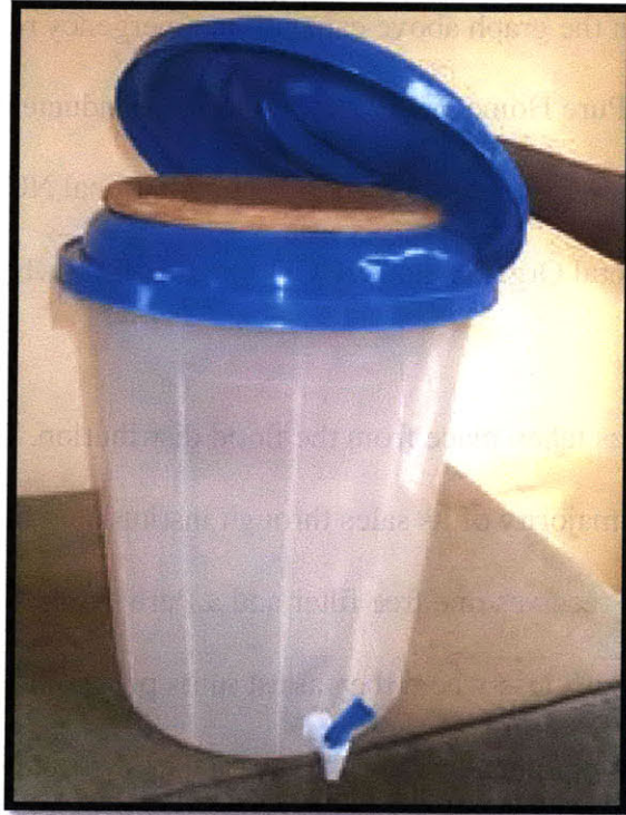
Figure 1: Kosim Filter

Water can be accessed through a tap present at the base of the safe storage container.