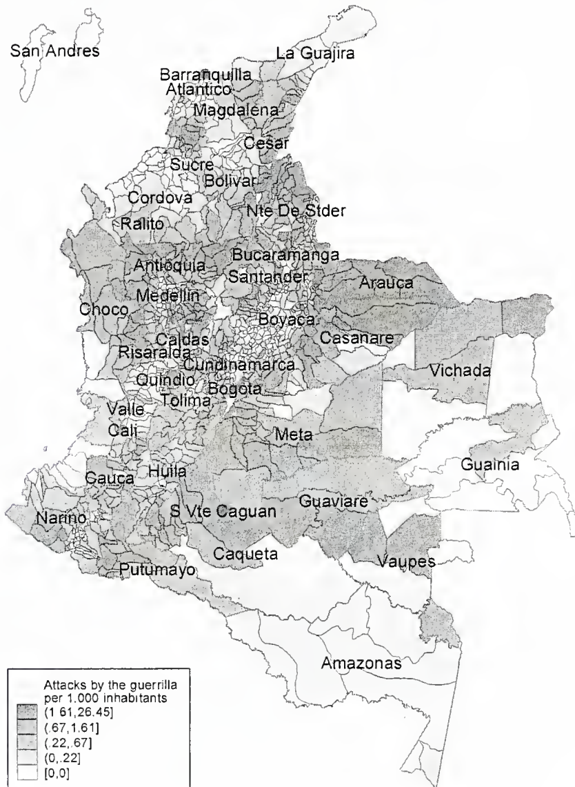
Map 1: Guerrilla Attacks, 1997-2005