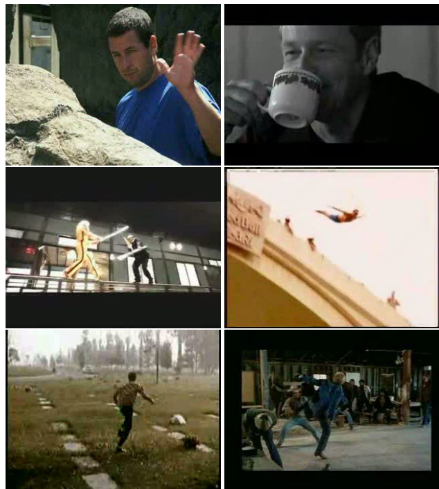
Figure 1. Sample frames from the proposed HMDB51 [1] (from top left to lower right, actions are: hand-waving, drinking, sword fighting, diving, running and kicking). Some of the key challenges are large variations in camera viewpoint and motion, the cluttered background, and changes in the position, scale, and appearances of the actors.

With several billion videos currently available on the internet and approximately 24 hours of video uploaded to YouTube every minute, there is an immediate need for robust algorithms that can help organize, summarize and retrieve this massive amount of data. While much effort has been devoted to the collection of realistic internet-scale static image databases [17, 23, 27, 4, 5], current action recognition datasets lag far behind. The most popular benchmark datasets, such as KTH [20], Weizmann [3] or the IXMAS dataset [25], contain around 6-11 actions each. A typical video clip in these datasets contains a single staged actor with no occlusion and very limited clutter. As they are also limited in terms of illumination and camera position variation, these databases are not quite representative of the richness and complexity of real-world action videos.