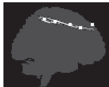
(d) Prior using nearest segmentation labels