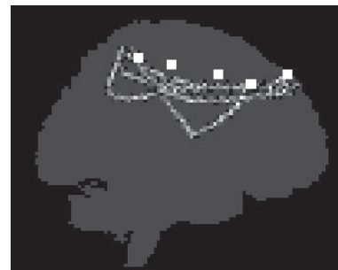
(c) Prior using local segmentation labels